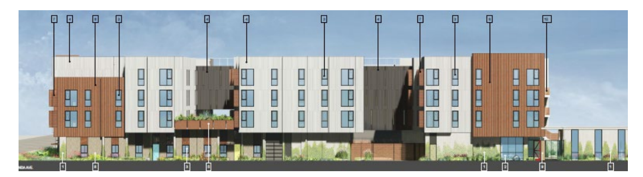
Figure 2: Armand Drive Elevation

• <u>Building Materials</u>: The building proposes to clad portions of the upper-floor facades in corten steel siding to call attention to key features, while the remainder is proposed to be fiber cement siding. The base of the building is treated with thin brick, wood siding, and metal paneling. Staff believes that additional refinements are required for the type of building material and transitions to provide interest, scale, and texture to the massing. Additionally, the first-floor material should be enhanced to increase the pedestrian interest at the sidewalk level.