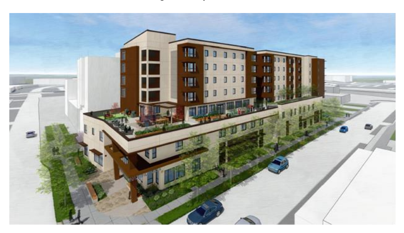
Figure 2: Project Site Looking Northwest from Linda Vista Avenue and Terra Bella Avenue