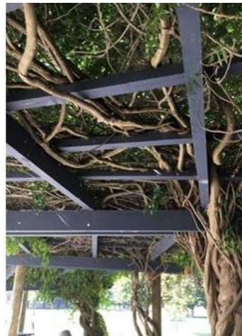
Figure 5: Photos of Wisteria