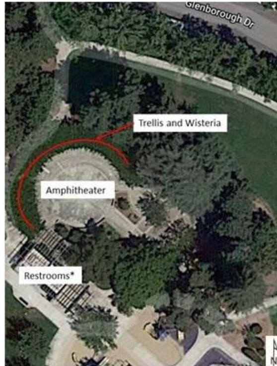
Figure 2: Project Work Area Map

During the renovation of the restroom building a few years ago, City crews discovered that the nearly 40-year-old trellis over the restrooms was unstable, and it was removed. When City staff removed this unstable section, staff began to consider the long-term viability of the entire trellis system. This trellis provides a shady area for people to gather and enjoy the park, with mature wisteria growing on top and game tables beneath. In 2018, a structural inspection of the trellis, performed by Biggs Cardosa, found it to be in poor condition. It was determined that repairing the structure would be more difficult and costly than replacing it. Based on these findings, the City funded Sylvan Park Trellis Replacement, Project 21-47, to replace the trellis.