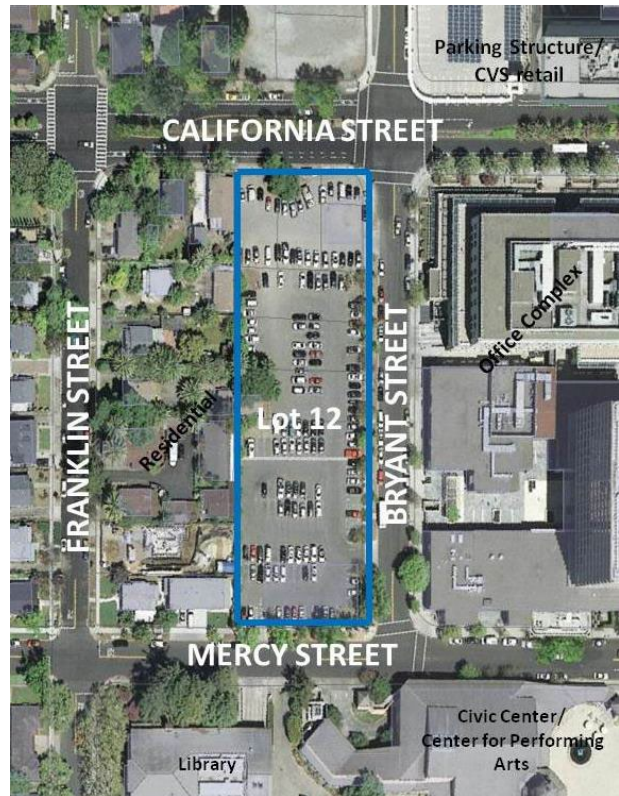
Figure 1: Lot 12

Responses to this RFP must be received by the City by March 2, 2020, 5:00 p.m., Pacific Time.