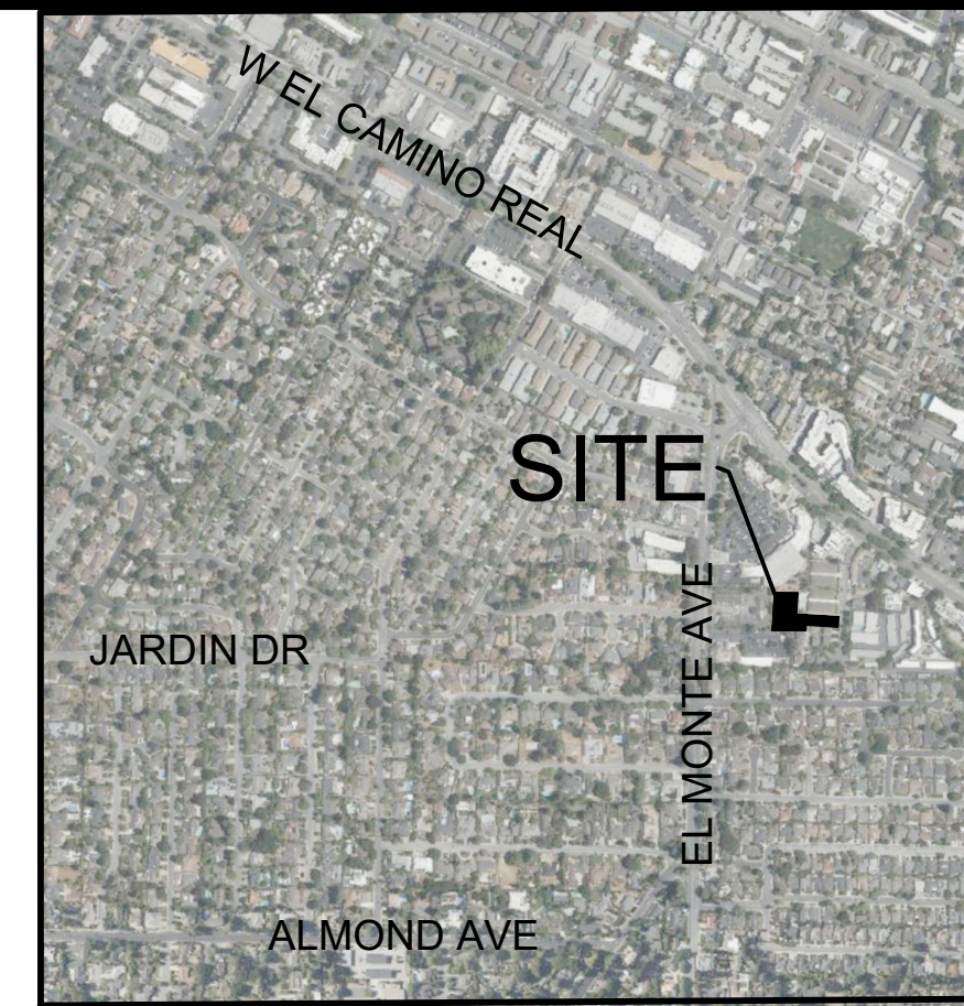
VICINITY MAP SCALE: 1" = 1000'