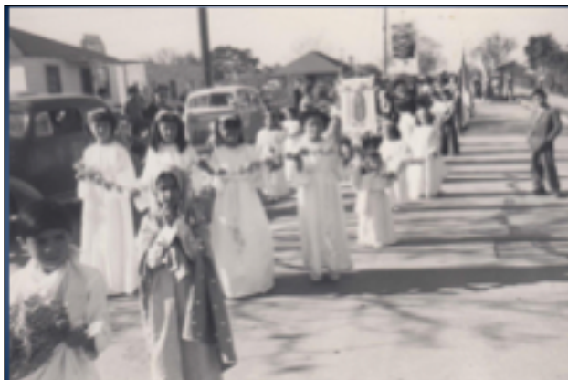
Feast Day of the Virgin of Guadalupe Procession Crossing Alma Street