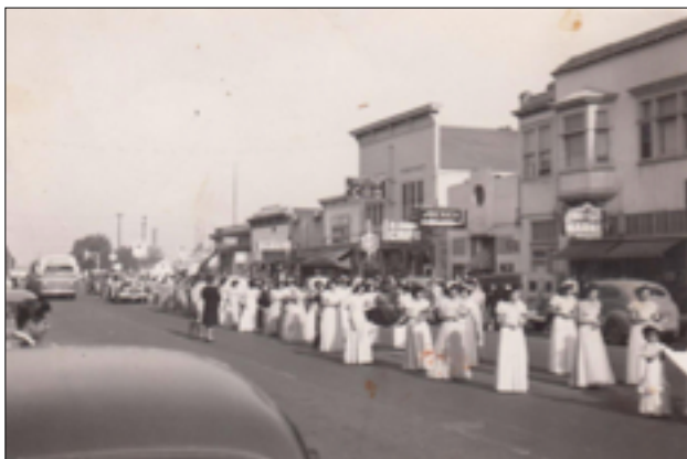
Feast Day of the Virgin of Guadalupe Procession on Castro Street