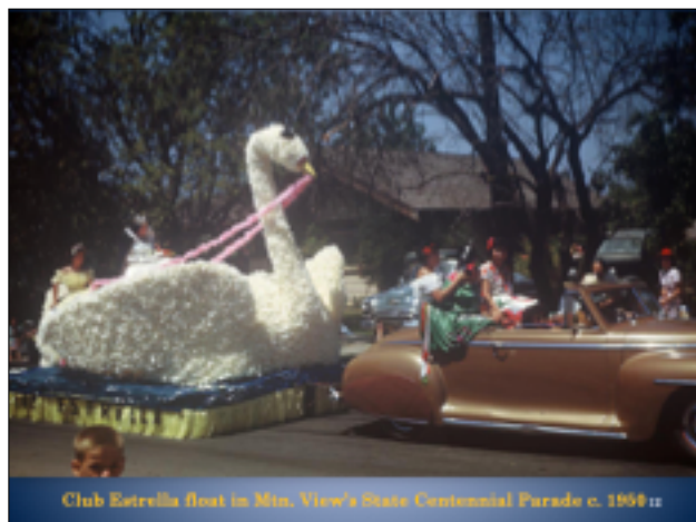
Club Estrella float in Mtn. View's State Centennial Parade c. 1950 12

Club Estrella also participated in the 1950 California Centennial celebration held in the City Of Mountain View