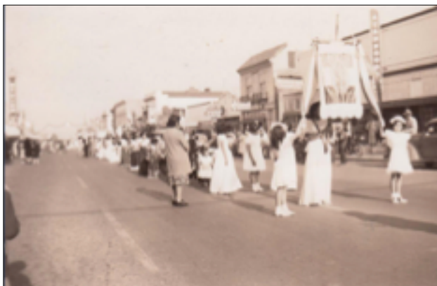
Feast Day of the Virgin of Guadalupe Procession on Castro Street c. 1947

City Of Mountain View parades in the late 40s early 50s