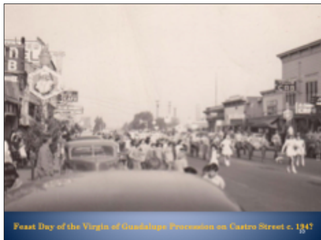
Feast Day of the Virgin of Guadalupe Procession on Castro Street c. 1945 10