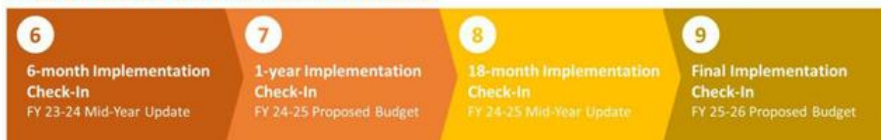
Figure 1: FY 23-25 Council Work Plan Development and Check-In Process