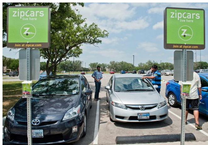
Figure 3 Reserved Zipcar Parking

A UC Berkeley study found that each carsharing vehicle takes between 9 and 13 private cars off the road, including member vehicles sold and postponed vehicle purchases. 11 In other words, a typical household with a carshare membership reduces its vehicle ownership, on average, by between 0.24 and 0.47 vehicles. By reducing vehicle ownership, car sharing typically reduces the number of vehicle trips. 12 Spaces will be located in the guest parking surface lots or in high-visibility parking spots within the parking garage, with clear exterior signage to increase visibility and emphasize the convenience of carshare. Figure 3 shows an example of Zipcars in a surface lot.