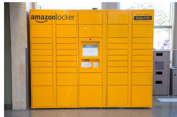
Figure 5 Amazon Storage Locker

This strategy has been implemented at Parkmerced Apartments, a residential apartment complex in Parkmerced near San Francisco State University. Residents have access to Amazon Lockers to help facilitate online ordering. Residents can have their packages delivered to the lockers and are then notified through the residential portal when their packages have arrived. 14 Madera Apartments in Mountain View also has a 24/7 package locker system. 15