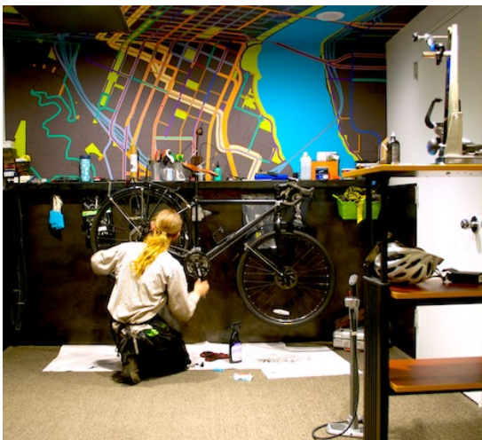
Figure 4 Bicycle Repair Station

The project applicant will set aside adequate space for installing two cycle repair stations on site. Each space should be adequate for a bike stand and necessary tools and supplies. Tools and supplies should include, at a minimum, those necessary for fixing a flat tire, adjusting a chain, and performing other basic bicycle maintenance. This may include a bicycle pump, wrenches, a chain tool, lubricants, tire levers, hex keys/Allen wrenches, screwdrivers, and spoke wrenches. Figure 4 shows an example bicycle repair station.