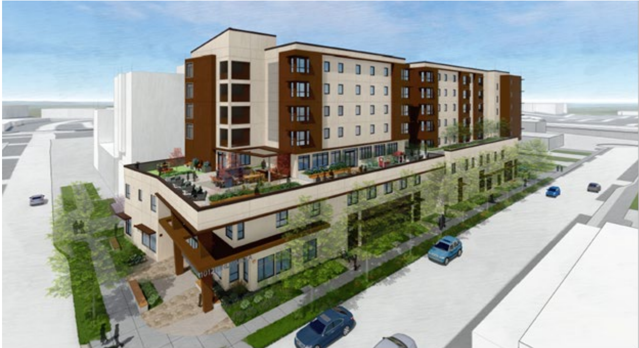
Figure 2 – Building Design

The project is designed to promote a welcoming corner at the intersection of Linda Vista and Terra Bella Avenues. The main lobby entry is oriented toward the corner/Terra Bella frontage, and carved out of the larger building base. The pedestrian entry emphasized by a large overhang and awning with columns and an entry plaza. At ground-level, the entry is also emphasized through a change in material finish. Ground-plane features are further emphasized by stepping back building massing from the corner and orienting more intensive third-floor courtyard amenities and landscaping to the corner.