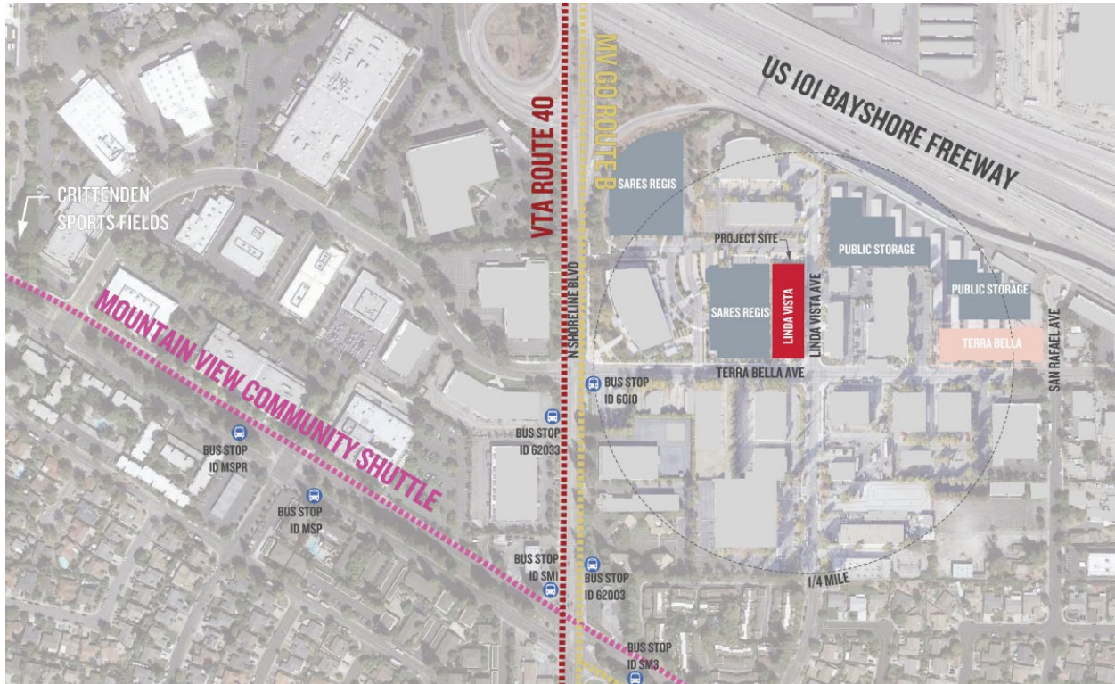
Figure 1 – Site Location

The site currently contains two one-story office buildings. It is bounded to the north and west by the 1001 North Shoreline Boulevard residential development project, currently under construction. One-story office/research and development buildings are across Terra Bella Avenue and Linda Vista Avenue from the site, while a new 2-story office building is on the diagonal corner.