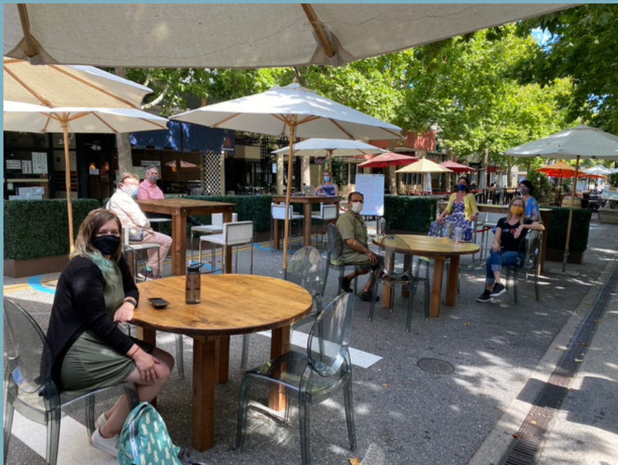
DBA Marketing Task Force Meeting