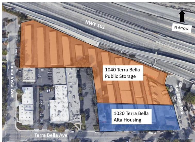
Figure 1: Locational Map