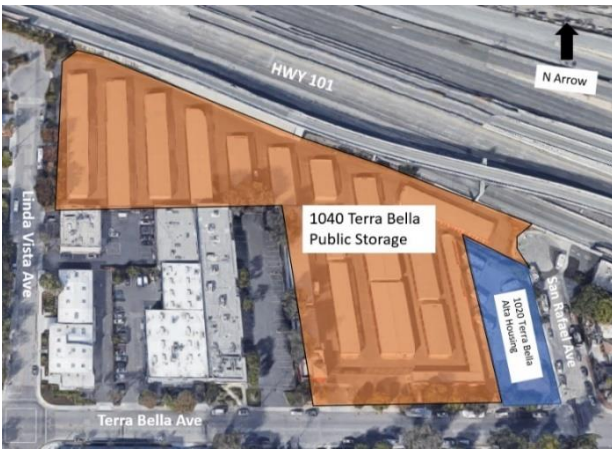
Figure 2: Existing Project Parcels