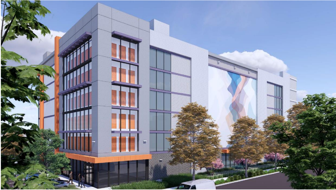
Figure 8: Rendering of 1040 Terra Bella Avenue from Linda Vista Avenue

As noted earlier, the Public Storage development generally complies with existing MM Zoning District standards, with the exception of parking and front and rear setback requirements. Staff has reviewed the proposed project and found the proposal to be compatible with the surrounding industrial/R&D uses and an upgrade to existing site conditions by providing high-quality architectural design and substantial landscape improvements.