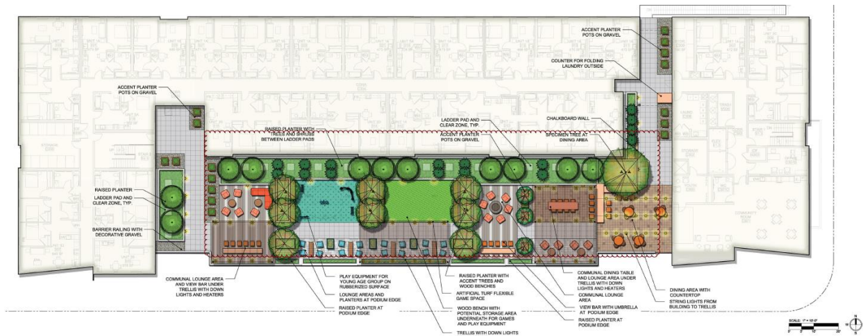
Figure 6: Podium Courtyard for 1020 Terra Bella Avenue

The building has a simple, modern design with horizontal fiber cement siding delineated by a mix of widely spaced vertical battens and recessed reveals and vertical standing seam metal siding applied to the upper floors of each building end/corner. The two building corners facing Terra Bella Avenue feature angled inset walls with projecting fins to highlight this building accent. The ground-floor facade and windows are accented with steel awnings, sunshade elements, or trim details intended to provide visual interest and/or pedestrian-oriented features.