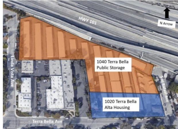
Figure 3: Proposed Project Parcels