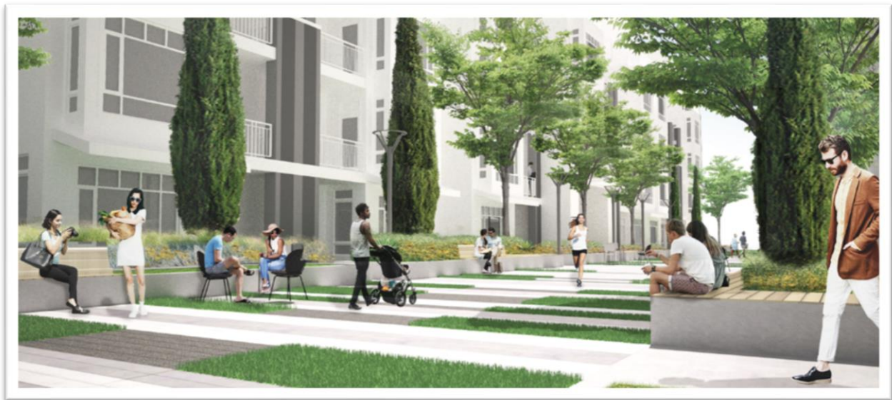
View Along the Proposed Emergency Vehicle Access/Paseo

Landscaping and ground-floor unit entries are prioritized along the on-site EVA/paseo and around the future public park. New street trees will be provided along the project frontage on East Evelyn Avenue to add to the existing street tree canopy, and in setback areas and on-site planters above the garage.