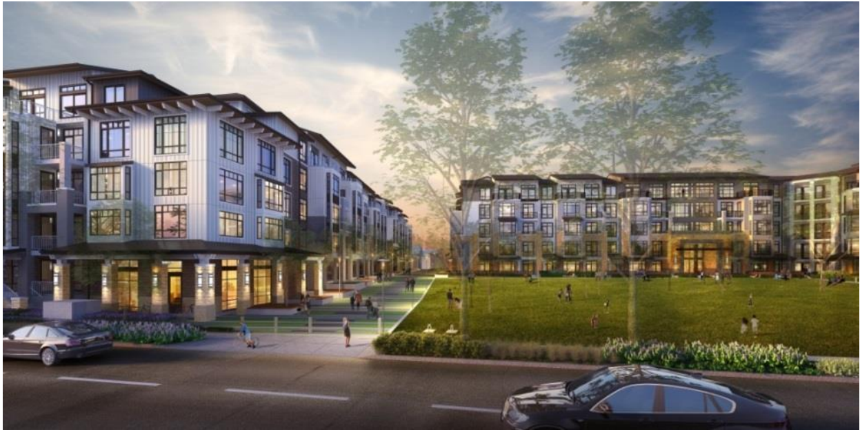
View from East Evelyn Avenue

The two buildings are designed with similar but differentiated architectural schemes. Building A uses a mix of stone materials and wood accents (e.g., trellises, porches, etc.) to help define a strong two-story building base, with horizontal siding and stucco cladding of primary building walls. Building B incorporates stone and wood accents on ground-level porches and entries, with a mix of board and batten, shingle, and stucco materials on projecting features and primary walls. Both buildings use varied roof forms to fit in with other buildings in the area.