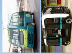
Autonomous Vehicle Examples