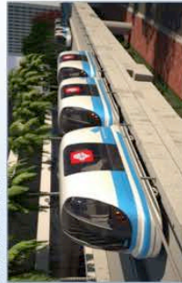
Conceptual rendering of new autonomous vehicles