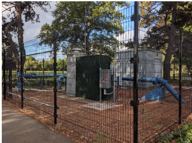
Figure 1: Well 17 at Rengstorff Park

The City owns seven potable groundwater supply wells distributed throughout the City's water service area. Four wells (19, 21, 22, and 23) are currently active. The remaining three wells (10, 17, and 20) have reached the end of their useful lives due to mechanical issues and low production and are out of service. Well 10, located near the Central Expressway and Rengstorff Avenue intersection, was constructed in 1956 and placed out of service in 2008; Well 17, located at Rengstorff Park (see Figure 1), was constructed in 1960 and placed out of service in 2014; and Well 20, located near the Alice Avenue and Moorpark Way intersection, was constructed in 1985 and placed out of service in 2011. A location map showing these three wells is provided in Figure 2.