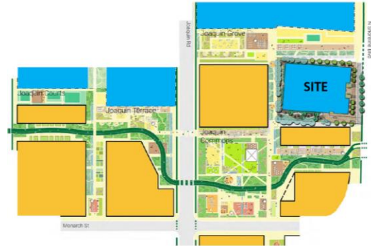
Project Enhances Google's Open Space Plan

Further, as shown in Figure 5 , the southern edge of the project site is located directly north and adjacent to Phase I of Google's Master Plan along the N. Shoreline Boulevard corridor 20 . Together, Google's Phase I and the 1808 N. Shoreline Project will provide an important anchor along the western side of N. Shoreline Boulevard extending towards Charleston East, which will help complete critical components of transportation, pedestrian, and bicycle infrastructure along both sides of N. Shoreline Boulevard.