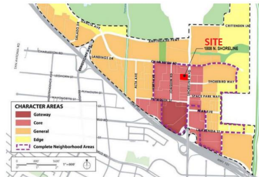
Figure 1 Project Site in Core Area of NBPP