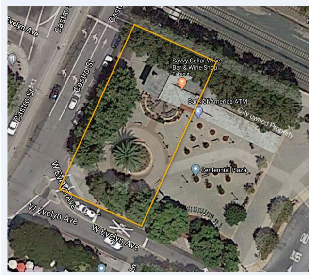
Figure 1 – Savvy Cellar Location on City-Owned Parcel