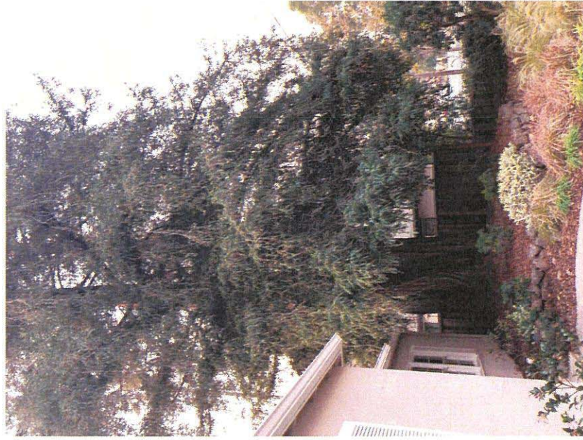
Figure 1. View across the front yard, from the Driveway