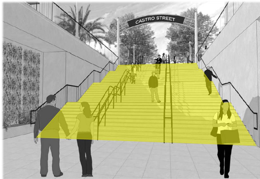
Figure 4: Castro Street Stairway