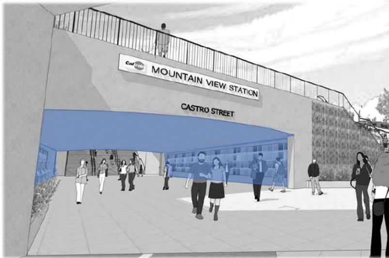
Figure 1: Castro Street Undercrossing