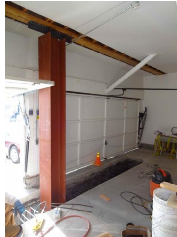
2D. Cantilever column installed with new concrete footing (awaiting concrete)