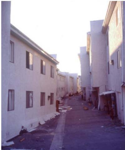
1B. Left: Collapsed 3-story building. Right: Sidesway damage, Los Angeles, Northridge earthquake