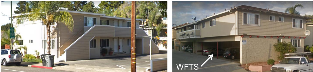
2-story, 6-unit buildings. Left: No WFTS. Right: WFTS, “Long Side Open” type.