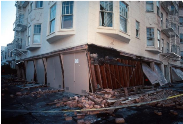
1A. Near-collapse, San Francisco, Loma Prieta earthquake