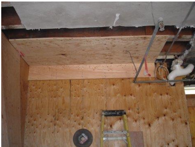
2E. Local strengthening of the second floor diaphragm