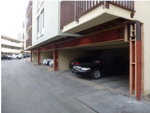
2C. Three-bay steel moment frame installed around garage door openings, with new concrete footing