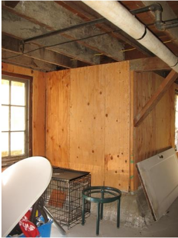
2A. Wood sheathing applied over existing studs, using the existing concrete foundation