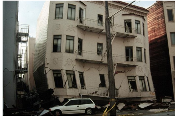
1B. Collapsed 4-story building, San Francisco, Loma Prieta earthquake