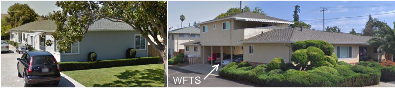
3-unit buildings. Left: 1-story, no WFTS. Right: WFTS, “House Over Garage” type.