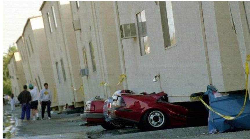
1D. Collapsed 3-story building, Los Angeles, Northridge earthquake

A collapsed soft story building adjacent to a public way also threatens public safety and blocks sidewalks and streets. Where soft story buildings comprise a large portion of a city’s housing stock, the aggregate effect of their poor performance can exceed emergency shelter capacity, exacerbate housing shortages, and delay recovery citywide.