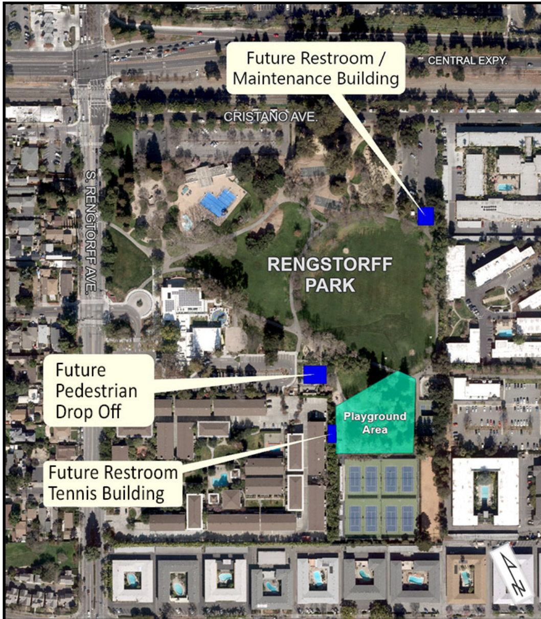
Figure 1: Project Site Map

In November 2021, the VAC began an artist selection process and confirmed the process for developing the public art. On March 9, 2022, the VAC selected two artists to design and construct murals at three locations within the project. The VAC selected Harumo Sato, a visual artist based in Mountain View ( www.harumosato.com ), to develop a mural for the maintenance building. For the mural at the tennis building, the VAC selected Fernanda Martinez, an Oakland-based artist ( www.latintaart.com ).