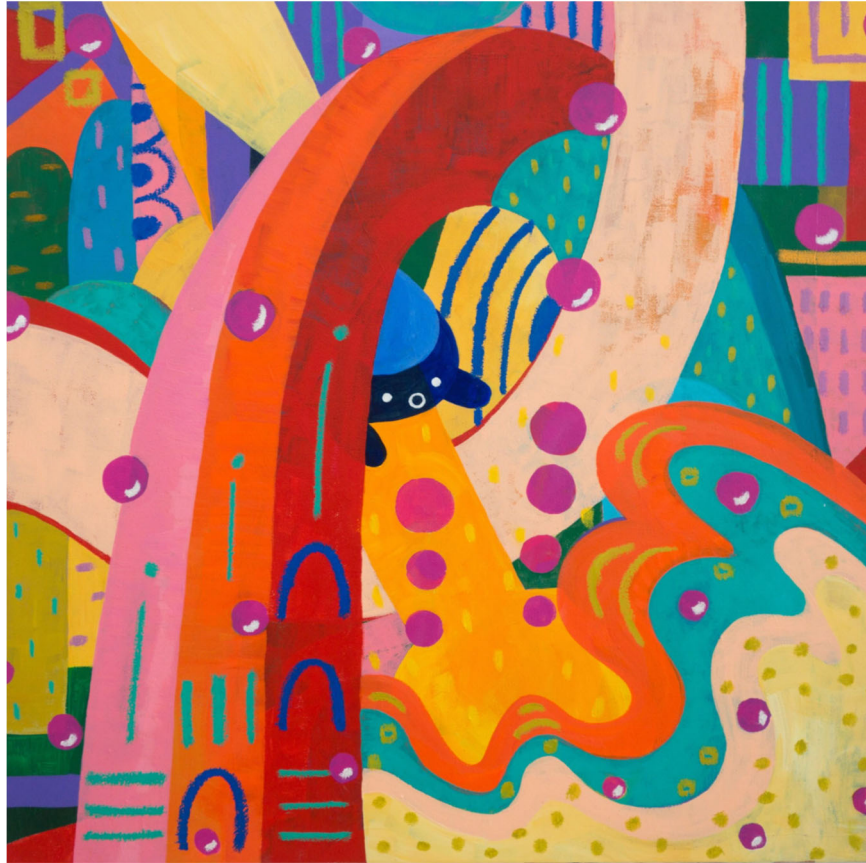
Figure 4: Mural Design and Color Palette—Harumo Sato