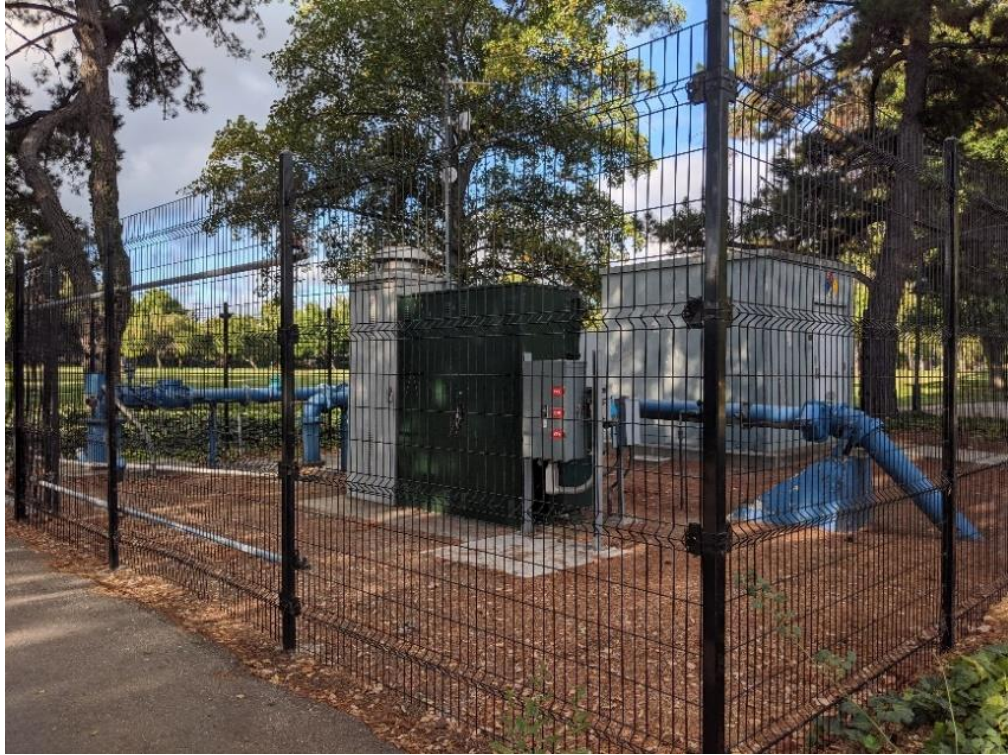
Figure 1: Well 17 at Rengstorff Park