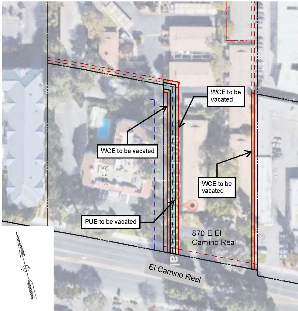
Figure 2: Easement Locations