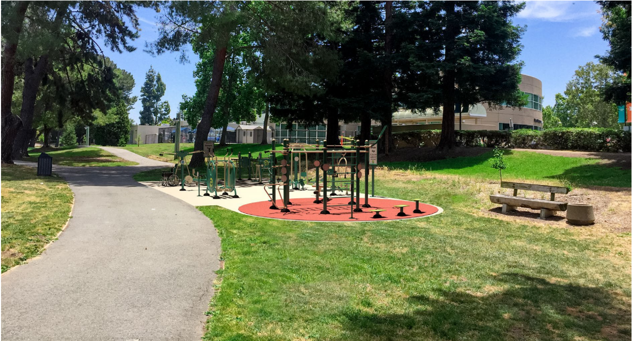
Figure 2: Concept Rendering Looking Southeast