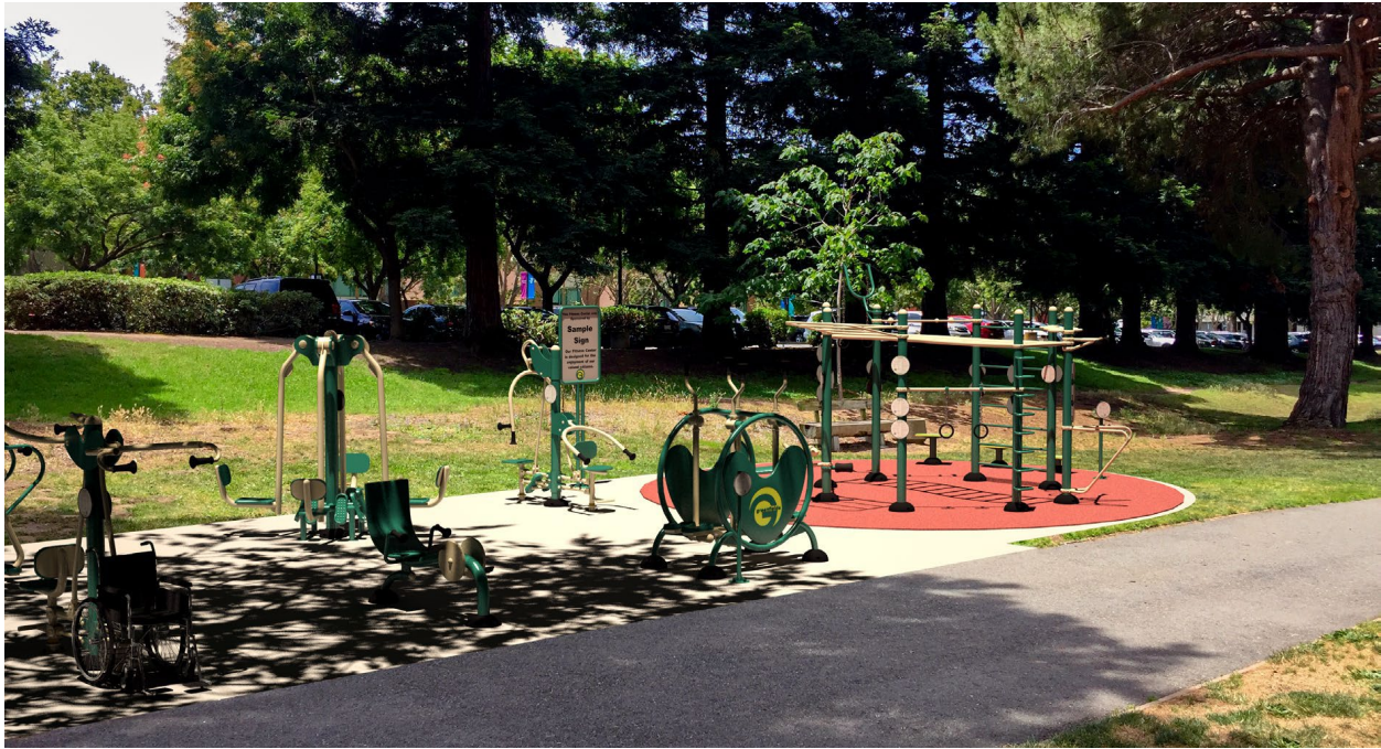
Figure 3: Concept Rendering Looking Southwest