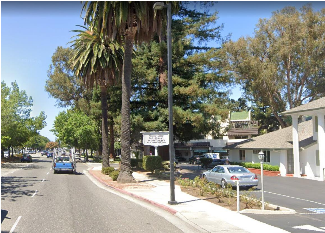
Figure 2: Two existing Canary Island Date Palms at 96 West El Camino Real

In May 2020, as part of the California Environmental Quality Act (CEQA) process for the El Camino Real Streetscape Plan, the certified arborist report prepared by HMH confirmed that these two palms are Canary Island date palms and are classified as Heritage trees with circumferences of 88". The palms' removal and replacement recommendations were included in the CEQA documentation and filed with the County of Santa Clara in September 2021.