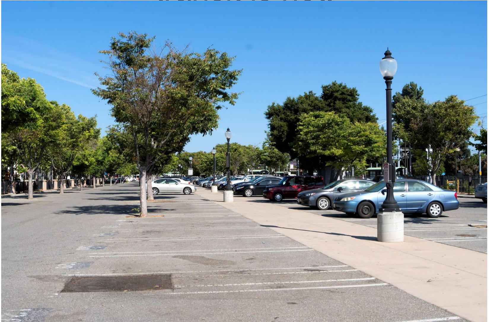
Mountain View Caltrain Parking Lot

Freeways are crowded, mass transit is not.