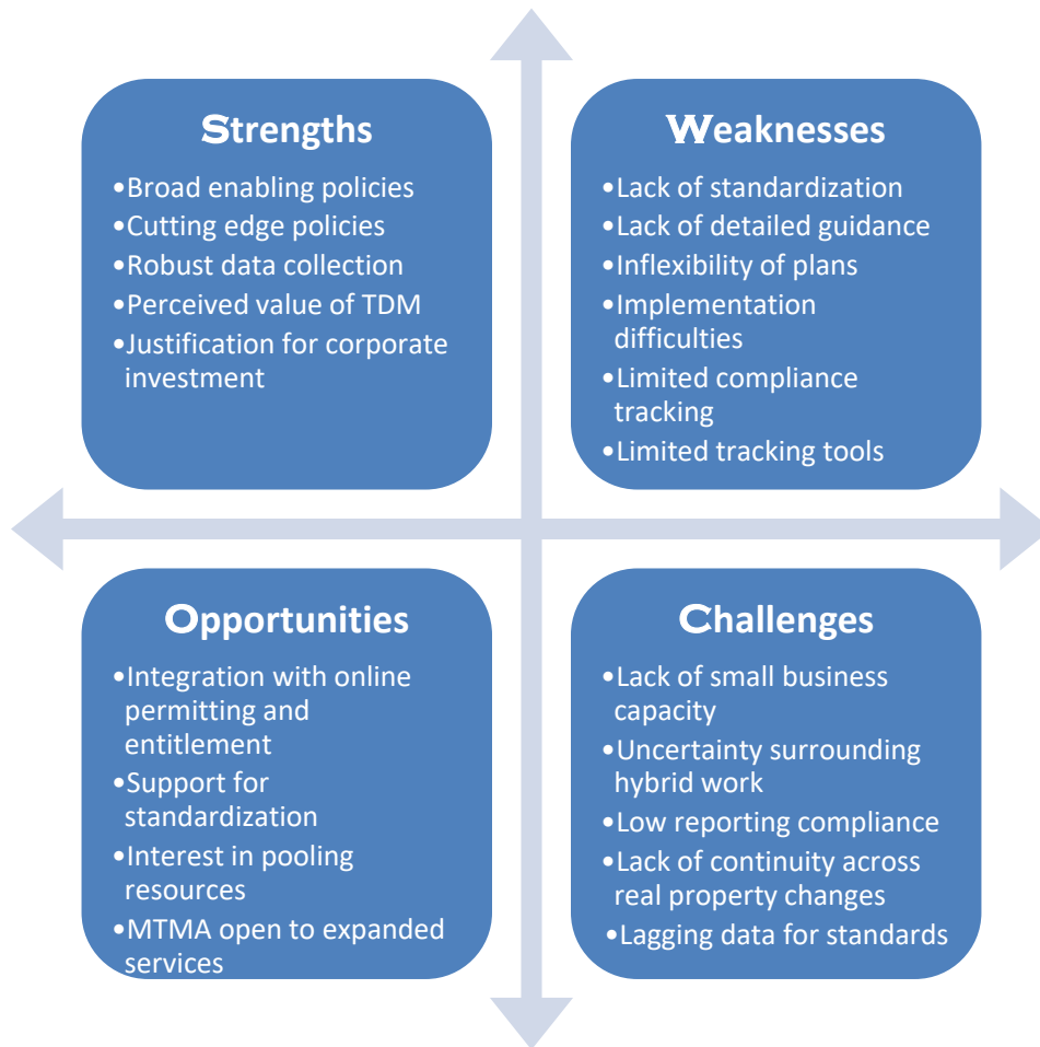
Figure 2: Strengths, Weaknesses, Opportunities, and Challenges with Current TDM Arrangements

Key findings from the Existing Conditions Report (Attachment 1) and stakeholder input are summarized in the following sections. A summary of the strengths, weaknesses, opportunities, and challenges (SWOC) analysis of the City's current TDM requirements and processes is also displayed in Figure 2.