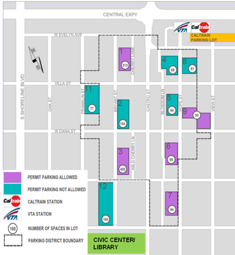
Map 1: Downtown Mountain View Parking Map

The Parking District also collects a Parking In-Lieu Fee. Developers/businesses within the Parking District (see Map 1 for the boundaries) are required to add parking spaces or pay a fee (currently $52,000 per parking stall) in lieu of providing parking on-site. Many of the individual properties within this area are small and/or oddly shaped, so to have them provide their own parking on-site could be highly inefficient or render the businesses infeasible. As such, the purpose of the in-lieu fee is to pool funding from development to create larger/more efficient parking facilities to support properties in the historic Castro Street commercial area. This allows the City to work with private property owners in creating a cohesive public parking system instead of smaller private parking lots/structures scattered throughout downtown. The Parking In-Lieu Fee revenue can only be used for the creation of new public parking spaces. Current in-lieu funds are fully allocated to build 75 net-new public parking spaces at the Hope Street Development Project (Parking Lots 4 and 8).