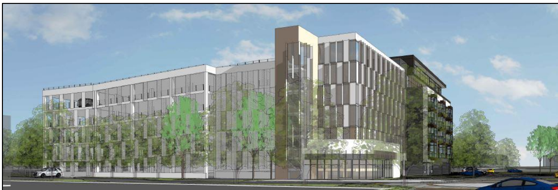
Proposed Office Parking Garage

Precise Plan provides guidelines for parking structures that would benefit this project, including a guideline that generally limits the height of parking structures to 45' (about four stories). The Draft Plan also states that parking structures should be clearly secondary to other structures on-site in terms of massing. Undergrounding a portion of the office parking structure would allow for decreased height consistent with the Draft North Bayshore Precise Plan.