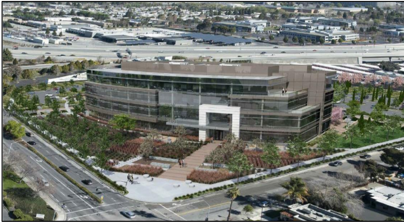
Office Building Elevation

The office development currently under construction on the project site was approved by the Zoning Administrator on July 9, 2015; completion is anticipated in summer 2017. The project includes the demolition of nine existing commercial structures and the construction of a four-story, 111,443 square foot office building with 371 surface parking spaces and the removal of 33 Heritage trees.