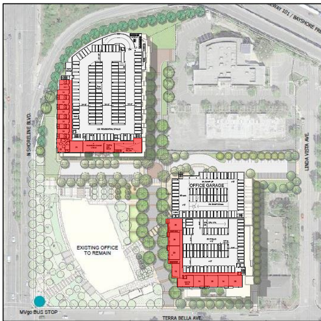
Garage Wrap Diagram – Units/Common Area Wrapped Around Garage

Underground parking has been required for nearly all recent residential developments in the City. Above-grade parking structures have been allowed in most office developments. From a site development perspective, underground parking provides for more efficient use of limited space, greater open space opportunities, and active ground-floor uses.