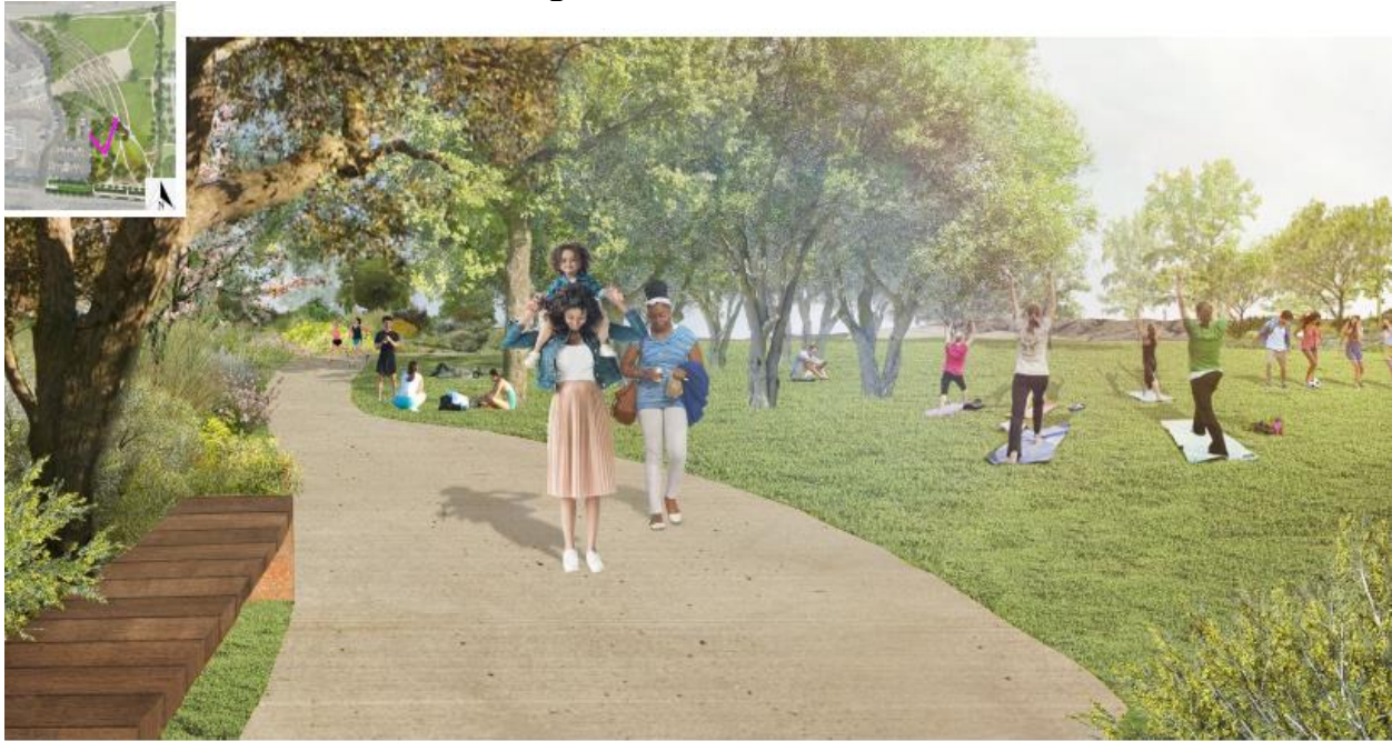
Figure 4: South Green