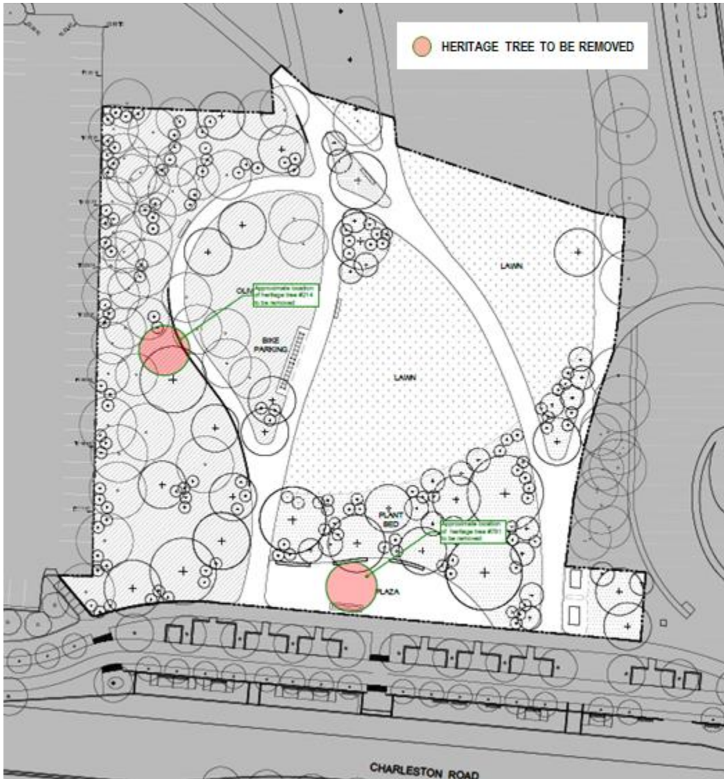
Figure 5: Heritage Trees Proposed for Removal

On March 13, 2019, the PRC reviewed the Heritage tree removal and mitigation plan for the proposed project. Based on public comment, the PRC requested that the Canary Island date palm be preserved and transplanted to a different location within the park. If transplanting and preservation of this tree is not feasible, the PRC requested a mitigation of 8:1 ratio with 24" box trees. The other Heritage tree (evergreen ash) was approved by the PRC for removal and mitigation at a 2:1 ratio with 24" box trees. If the Canary Island date palm tree can be transplanted successfully, the project will plant two new 24" box replacement trees. If the Canary Island date palm tree cannot be transplanted, the project will plant a total of 10 new 24" box replacement trees. New trees planted at the park will come from the NBPP Plant Palette and will mostly be