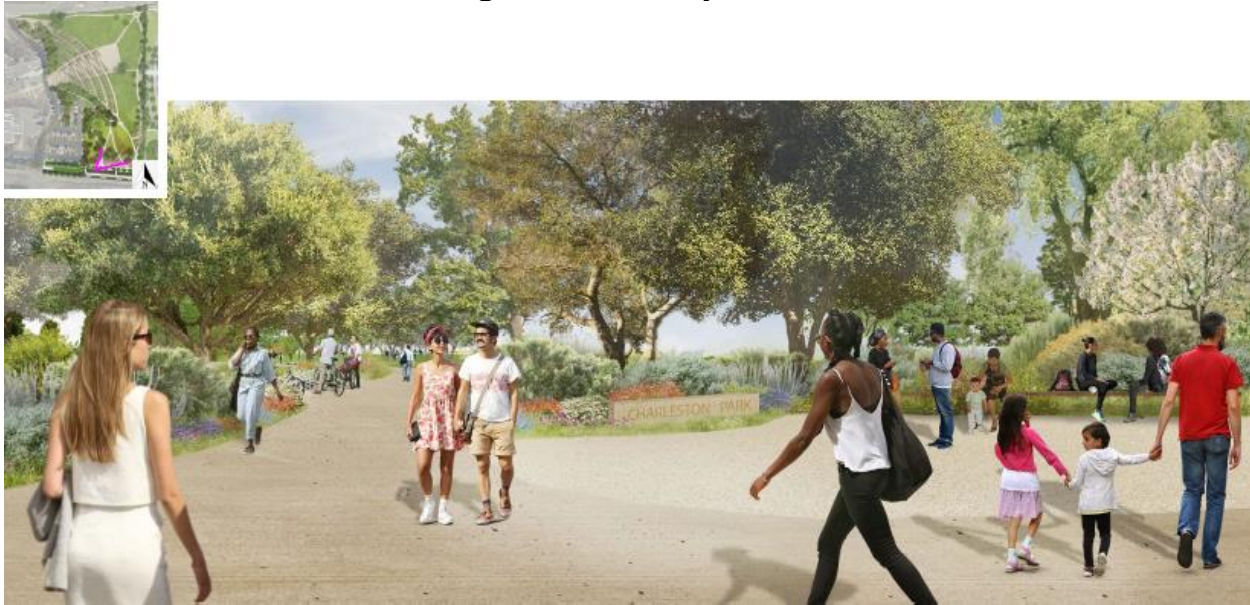
Figure 3: Gateway Plaza

a gateway for both transit and park users. A new park sign and benches will be installed at the plaza. A rendering of the Gateway Plaza is shown in Figure 3.