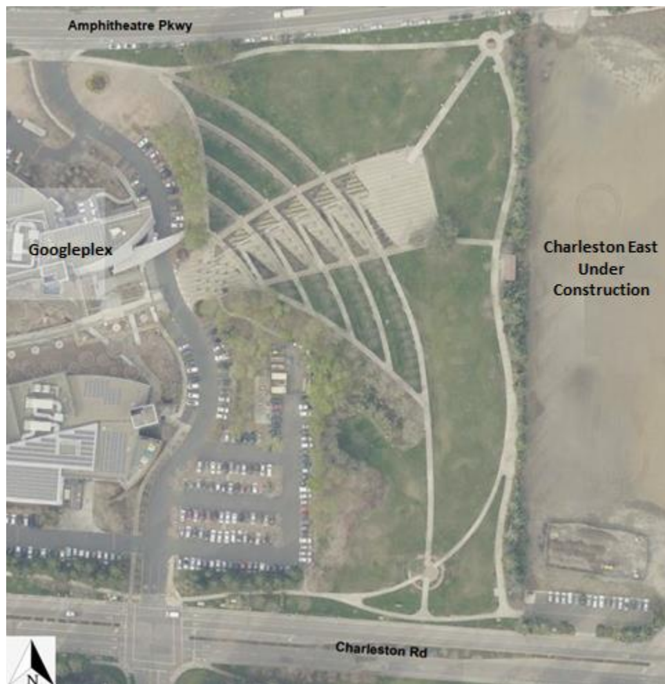
Figure 1: Existing Charleston Park

The proposed improvements adjacent to Charleston Park implement the North Bayshore Precise Plan (NBPP) requirements for Charleston Road, promoting active transportation, including sidewalks, two-way cycle tracks, a transit stop, bicycle parking areas, and landscaping buffers between each one of these facilities. The first phase of the construction of the Charleston Corridor improvements between Shoreline Boulevard and Huff Avenue is currently under way and is being fully funded by Google.