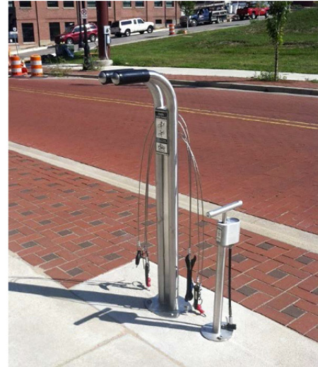
Example of Bicycle Repair Station