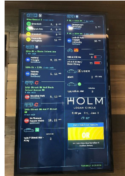
Source: Transit Screen Display in Holm Apartments, Washington, D.C.