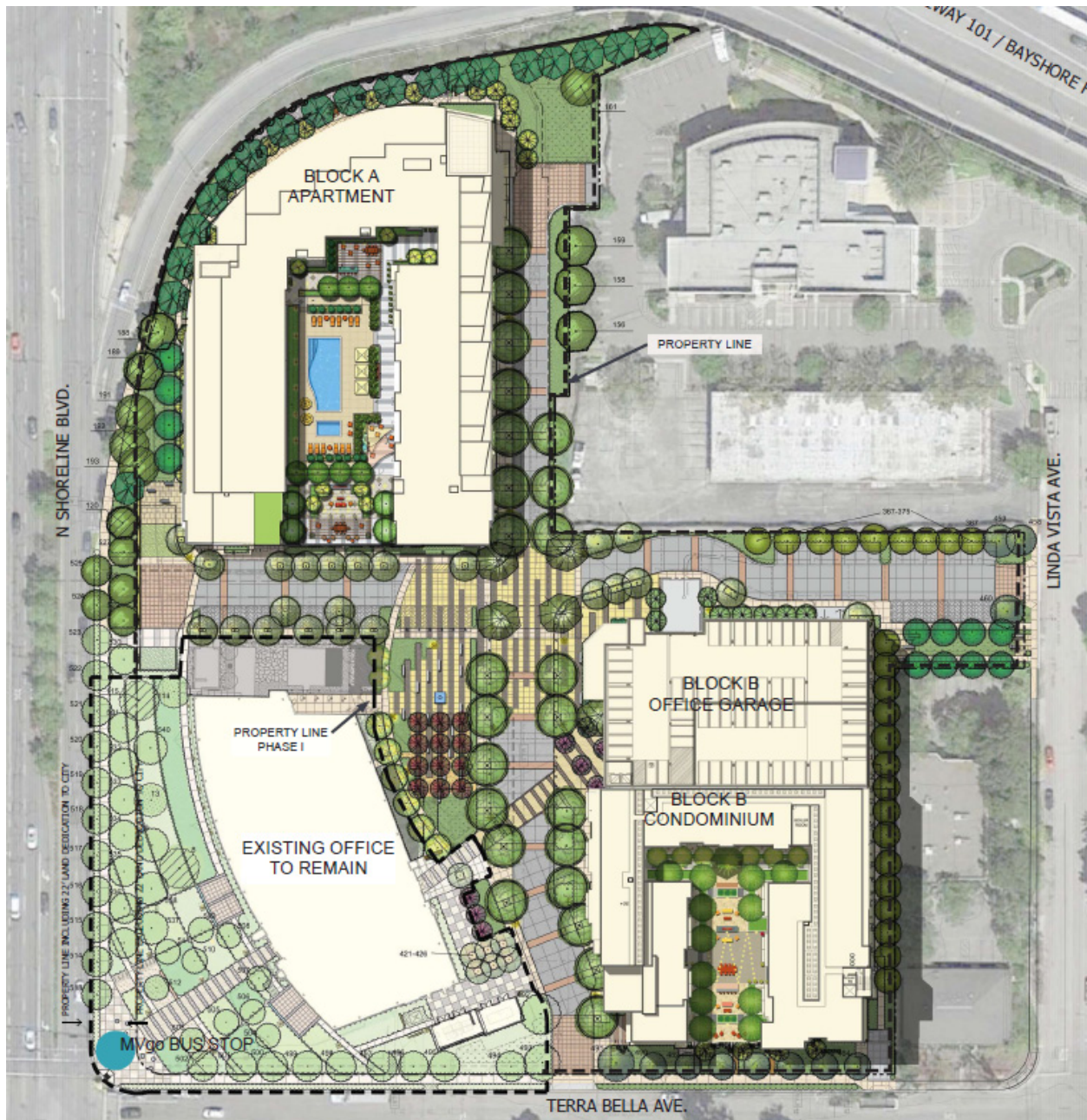
Plate 2 Project Site Plan