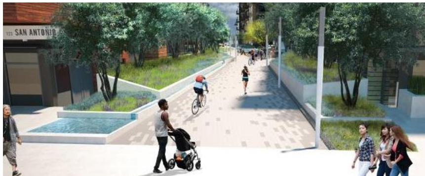
Paseo View from Miller Avenue

Both Buildings B and C have recessed wall areas where greater setback is provided, and upper floor step-backs along Miller Avenue to help with the overall mass and scale of the buildings as they transition into the adjacent residential neighborhood.