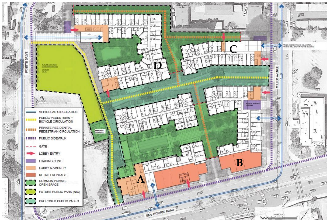
Site Circulation Diagram 1

Prioritizing pedestrian improvements is a guiding principle in the Precise Plan. To enhance the pedestrian environment, the applicant proposes a vibrant paseo (between Buildings A/B and Buildings C/D) and other large pathways between buildings and plazas in various locations. To improve connectivity throughout the plan area, the proposal includes two public pedestrian/bicycle paths: