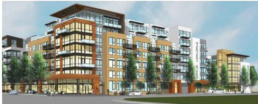
Building B – View from San Antonio Road/Miller Avenue Intersection

The Building B frontage along Miller Avenue is set back 24' at the ground level and provides a more residential design character as the project transitions