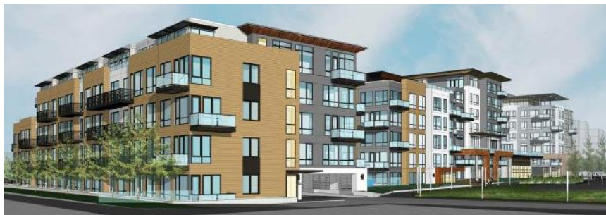
View from Fayette Drive

site fronting Miller Avenue is two stories. Particular attention was given to the north side of Building D and the south side of Building C as this is the area most visible from the two-story residential development fronting Miller Avenue. The building frontage along the west side of the property is set back 25' as the Precise Plan requires and the buildings step back at the fifth floor. The applicant has