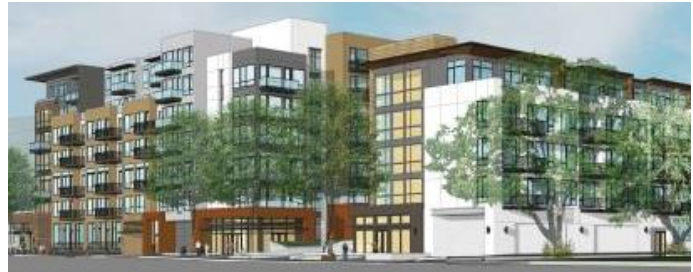
View from Miller Avenue

Careful design considerations were taken into account along these frontages as the buildings are adjacent to two residential developments. The residential development west of the project site fronting Fayette Drive is three stories and the residential development west of the project