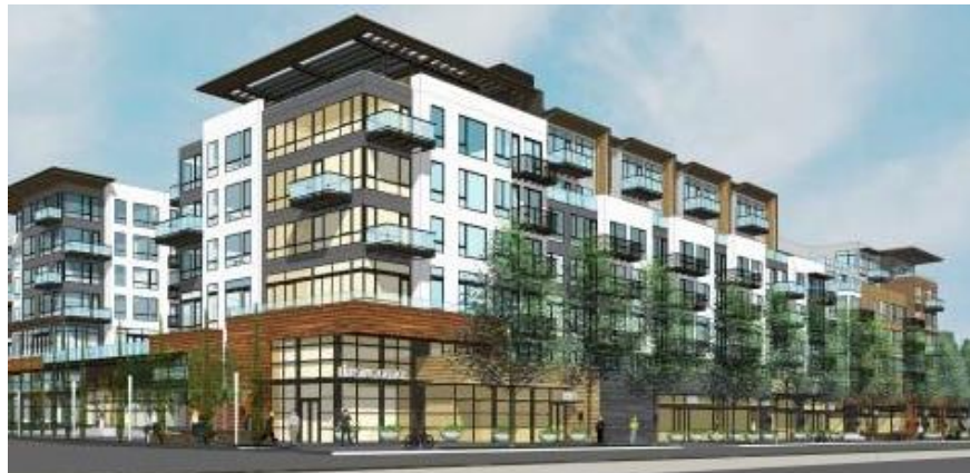
Building A – View Looking North on San Antonio Road

The ground-floor commercial space of Buildings A and B face San Antonio Road. One existing site tenant (Masa Sushi) will occupy the retail space on the corner of San Antonio Road and Miller Avenue. The