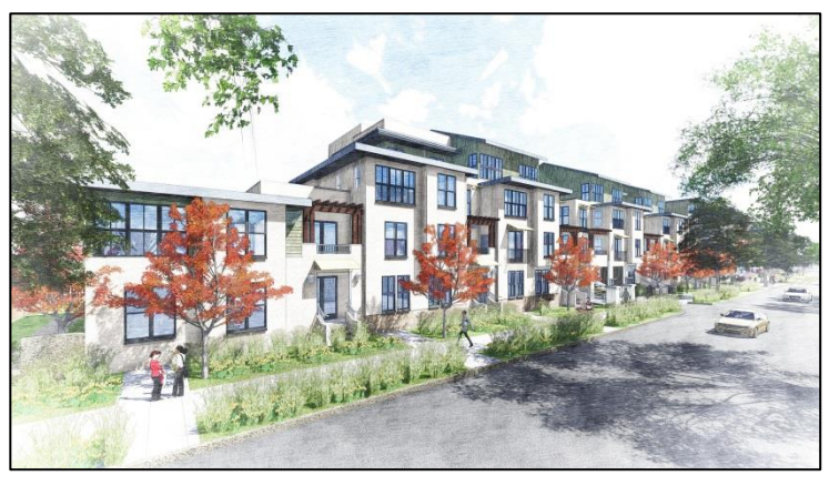
Castro Street Elevation - Looking North

The project is broken up into three main buildings with a four-story building along El Camino Real with commercial space on the ground floor, three floors of residential units above, and one floor of underground parking. The commercial tenant spaces along El Camino Real are programmed to include Peet's Coffee & Tea on the corner (fronting the public plaza) and Rose's Market. The second building is located along Castro Street and the alley with commercial tenant spaces on the ground floor, three floors of residential units above, and two floors of underground parking. This building would have commercial frontage along a portion of Castro Street and the alley and is anticipated to include Sufi Coffee Shop and Cultural Center, Tanya's Hair Design, Le's Alterations, and a fitness center and leasing office for the on-site residential units. The third building is located along Castro Street and includes two to four floors of residential units above two floors of underground parking.