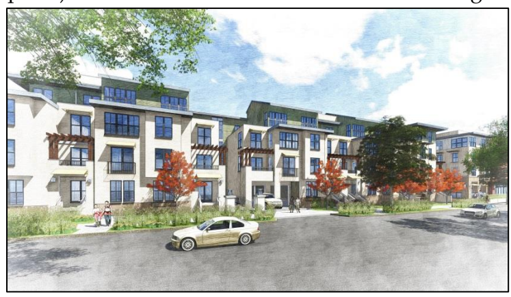
Castro Street Elevation

Commercial and Residential Entries—The El Camino Real Precise Plan requires that principal building entrances face the primary street frontage and open spaces (such as a plaza) and shall have doors and windows along the primary street in order to activate