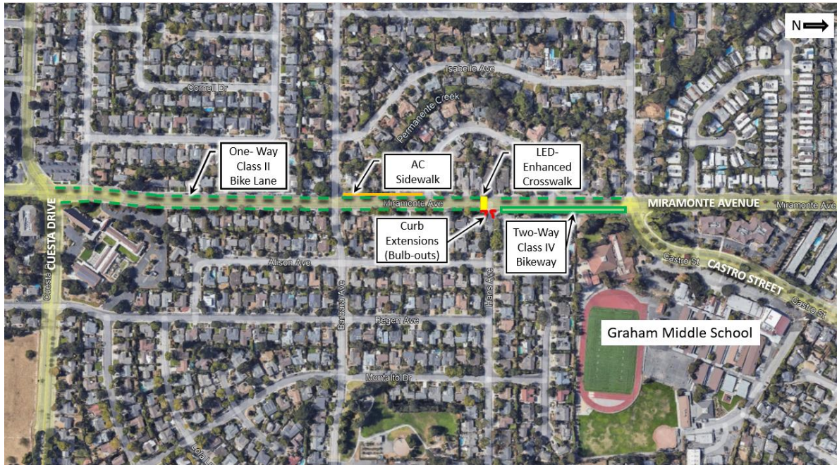
Figure 2—Bicycle and Pedestrian Improvements

The added scope is beyond staff’s technical and workload capabilities. Therefore, staff recommends retaining an engineering design consultant to provide the technical expertise and resources to advance the project while allowing City staff to concurrently manage other priority projects.