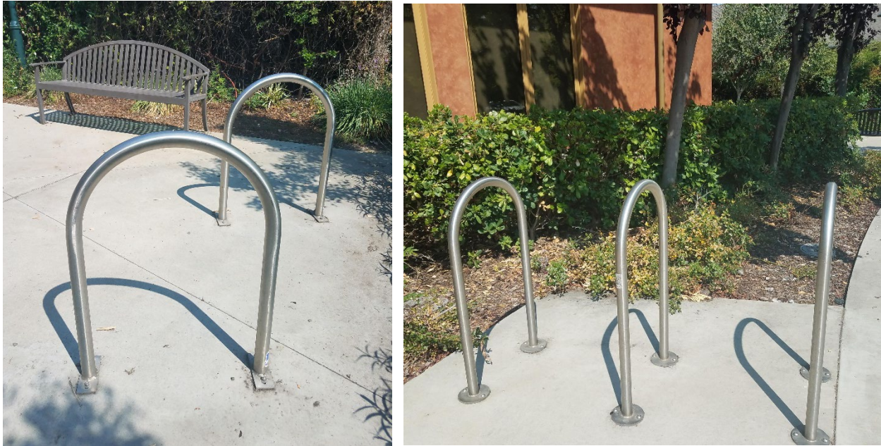
Figure 4: Stainless Steel Inverted U-Racks at the Senior Center