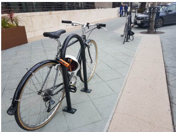
Figure 1: Class 2 Inverted U-Rack (left) and U-Rack Corral (right) along Castro Street

During the grant application process, the City committed to using inverted U-racks or inverted U-rack corrals under this program, as illustrated in Figure 1. These types of racks are described in the Valley Transportation Authority's (VTA's) Bicycle Technical Guidelines (BTG) as Class 2 bicycle racks.