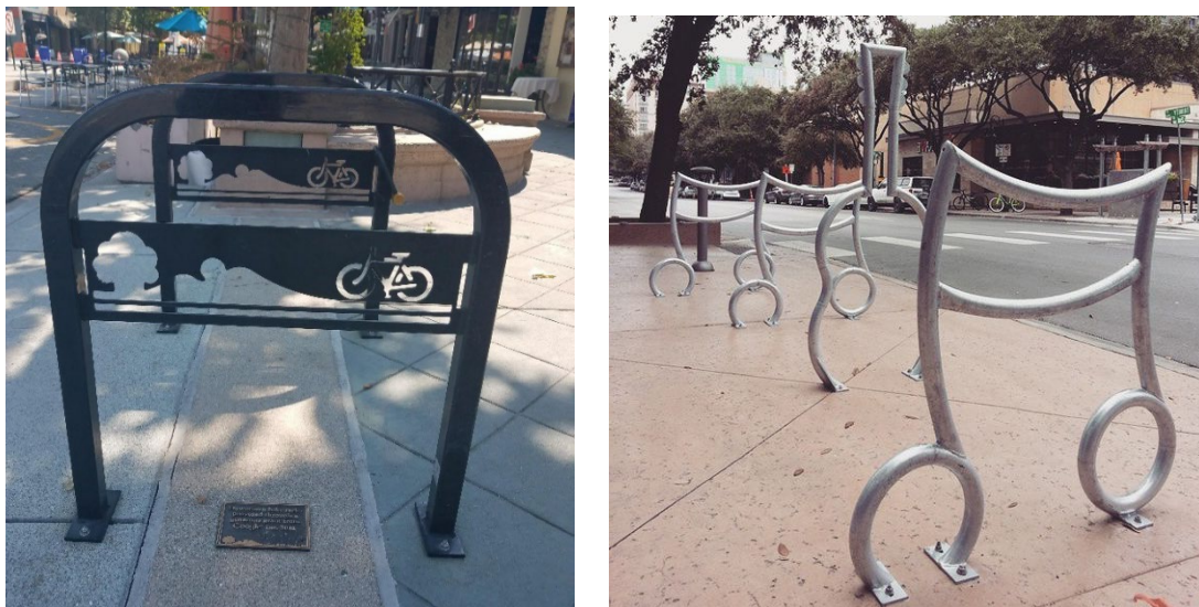
Figure 5: Customized Racks on Castro Street (left) and Art Racks in Austin (right)

The Community School for Music and Arts is located on City property near the San Antonio station. CSMA staff has tentatively expressed interest in bicycle rack installation at the site. This location could potentially be considered for art racks if funds permit and favorable bids are received.