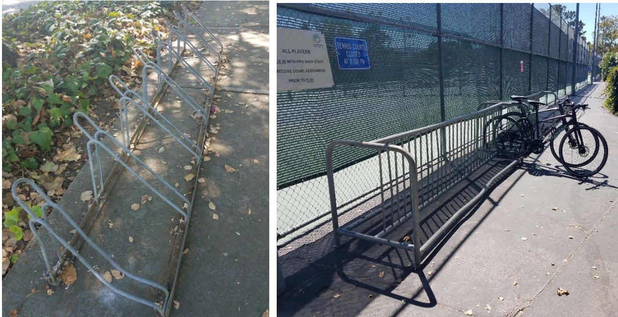
Figure 3: Class 3 Bike Racks at the Police and Fire Administration Building (left) and Cuesta Park (right)