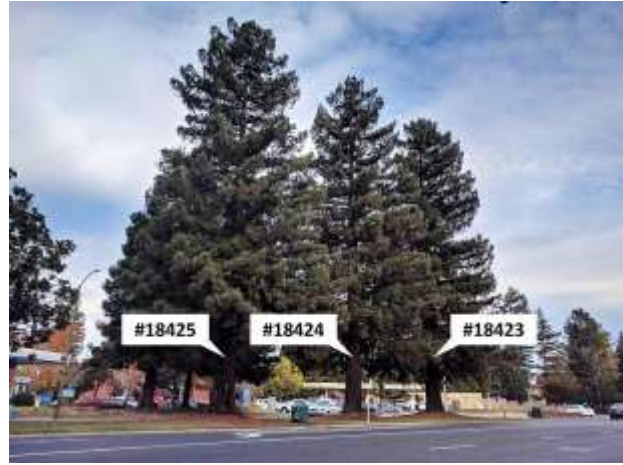
Figure 3— Three Trees on Middlefield Road to be Removed