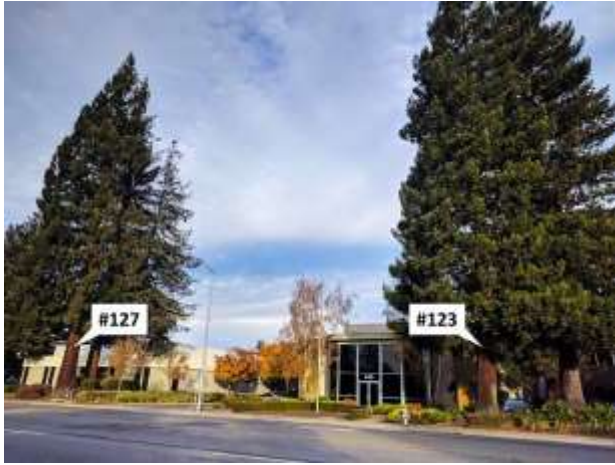
Figure 2— Two Trees on Shoreline Boulevard to be Removed

Figures 2 and 3 below show the five Heritage trees proposed to be removed.