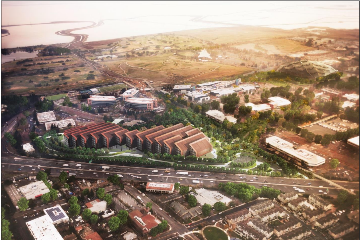
Google Landings Office Building

The office plans show extensive landscaping and native oak planting on a northern portion of property at 1875 Charleston Road, currently not owned by Google (see Page G008 of Attachment 1). The property owners of 1875 Charleston Road are aware of the project and this submission to the City. Google and the property owners are continuing to negotiate a deal to allow for the landscape improvements currently shown on 1875 Charleston Road. Discussions so far have been positive and must be resolved prior to the final Council approval of the project if this landscaped area currently in the plans is to remain.