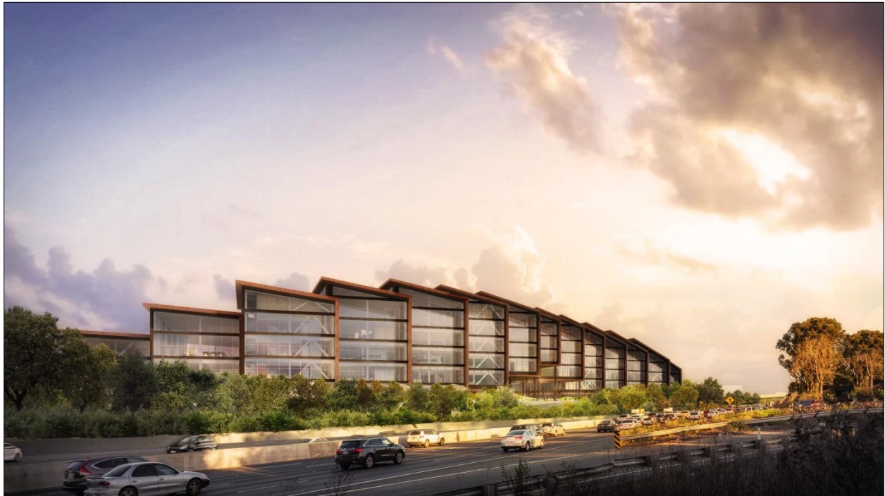
Proposed Office Building

Google states that they learned from Charleston East and that the current design responds better to the natural environment and the Precise Plan's sustainability goals than the initial design. The current design also does not require complex design and engineering solutions to construct the building, while it creates a greater diversity of high-end architecture in North Bayshore.