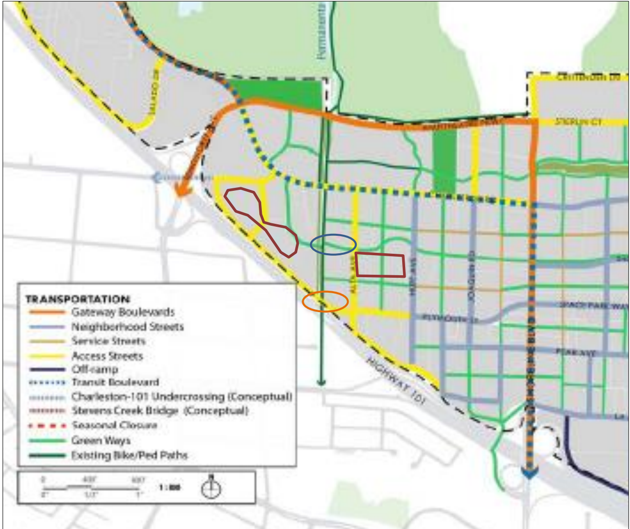
Precise Plan Conceptual Street Map