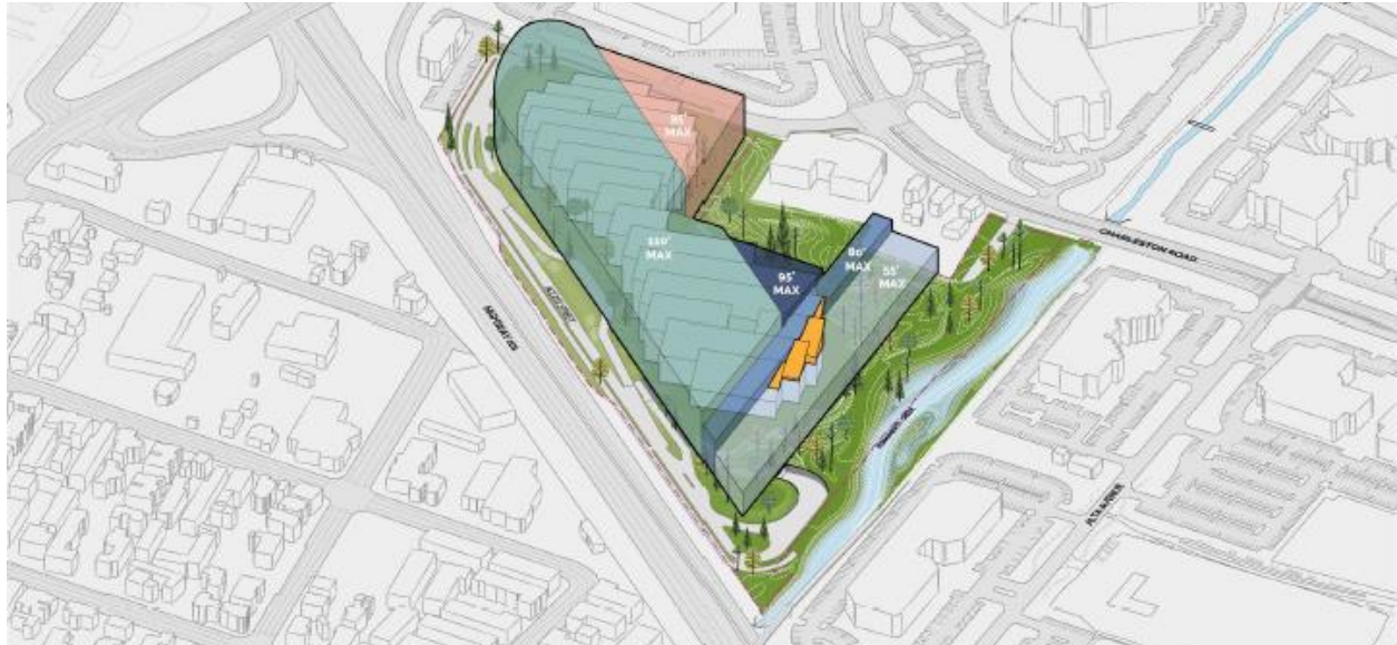
Office Protrusion into the 55' Height Limit (in yellow)

Google reasons in the plans that the overall building area proposed within this 100' encroachment area has significantly less square footage than what is allowable. Google believes that the extension over the maximum height guideline results in a superior project while also meeting the intent of the Precise Plan by providing a net ecological benefit. Google states that the project is establishing native habitats along the creek, removing the existing surface parking, and creating extensive habitat restoration.