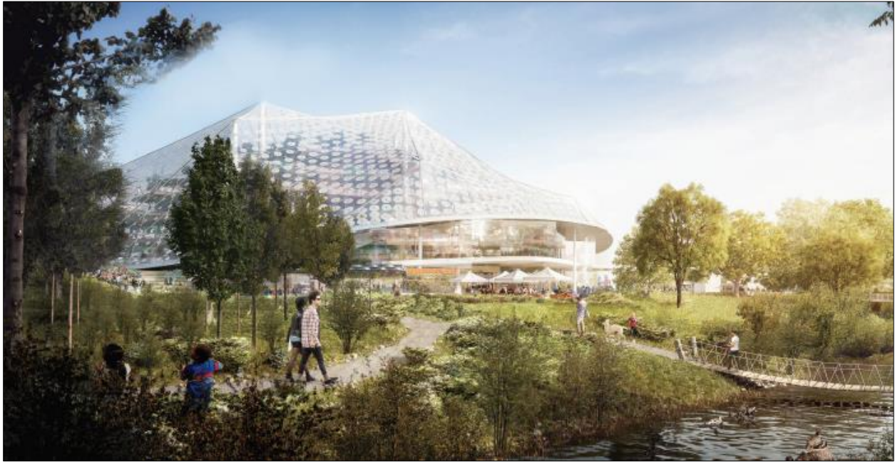
Google Landings 2015 Bonus FAR Design

Question 1: Does Council support the design direction for Google Landings?