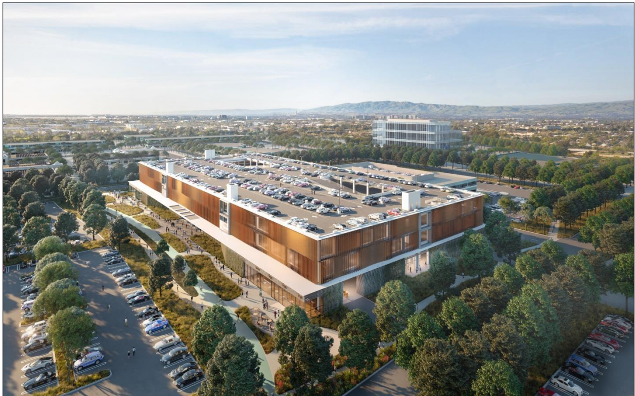
Huff Parking Structure

The off-site parking structure on Huff Avenue is four stories and 58' in height and is situated adjacent to the green loop path in North Bayshore. The overall building footprint is 566'x274' and includes 1,792 parking spaces and ground-floor retail facing the green loop. Additional discussion on the project's overall parking strategy follows below in the parking section.