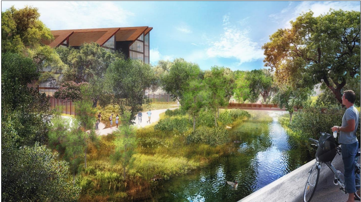
Office Building Viewed from Permanente Creek

As for the parking structure, the Precise Plan recommends a maximum height of 55' as a guideline, and the proposal features a height of 58', not including elevator and stair towers. Google states that the additional height was needed in order to make the structure flexible to a number of uses, including residential, should parking not be needed in the future.