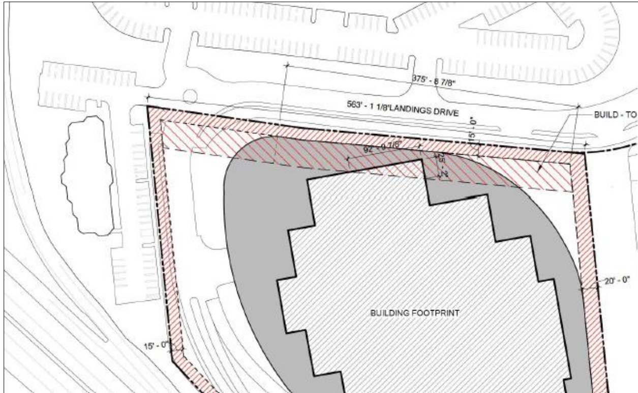
Build-to Area Graphic

along Landings Drive where it connects to Charleston Road are considered the front. This side was chosen because much of the rest of the site faces Highway 101 or Permanente Creek. The area that fronts Charleston Road does not need to meet front requirements because it is within the HOZ. However, the northwest portion of the site would need an exception since only 31 percent is within the build-to frontage requirements.