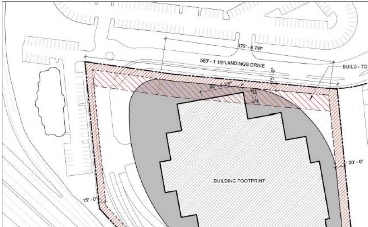
Build-to Area Graphic

along Landings Drive where it connects to Charleston Road are considered the front. This side was chosen because much of the rest of the site faces Highway 101 or Permanente Creek. The area that fronts Charleston Road does not need to meet front requirements because it is within the HOZ. However, the northwest portion of the site would need an exception since only 31 percent is within the build-to frontage requirements.