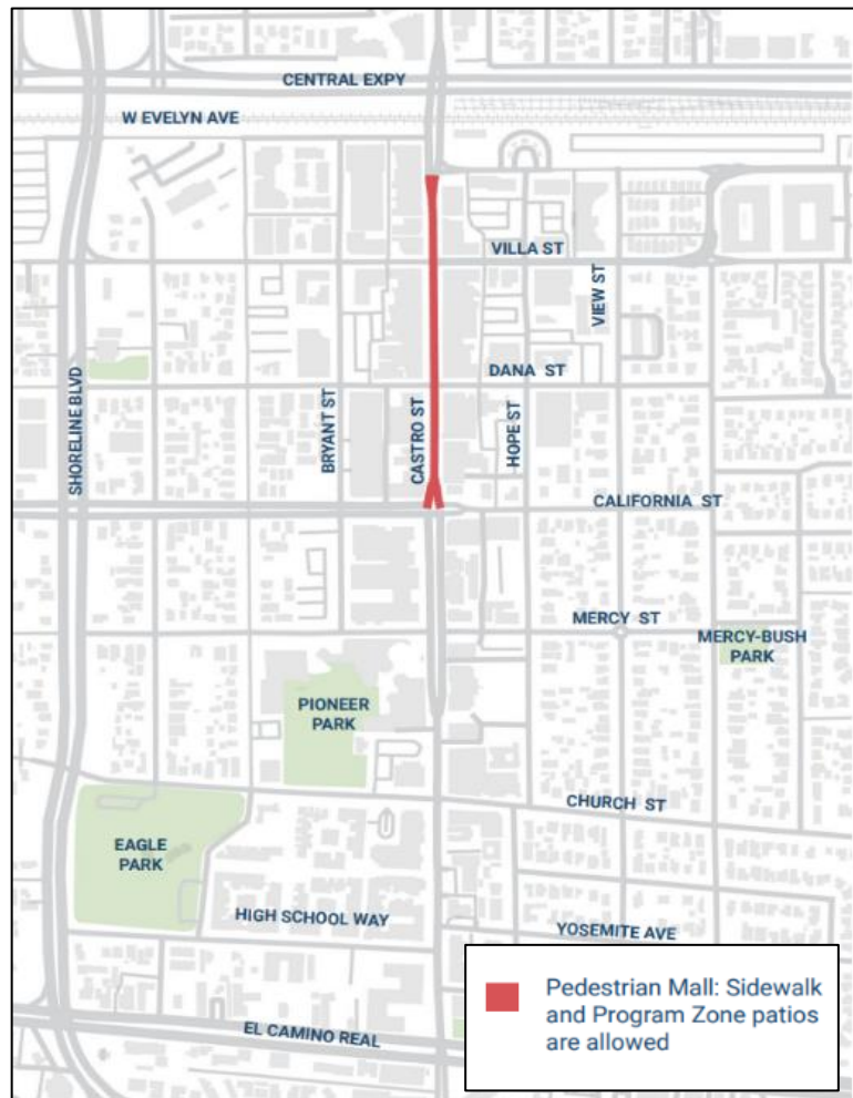
Figure 2: Pedestrian Mall Boundaries

In preparation of adoption, a Council ad hoc committee was created to review and provide direction for the design standards and guidelines for the Castro Street Pedestrian Mall. On March 20, 2023, the Council ad hoc committee reviewed the following items and recommended approval to the City Council: