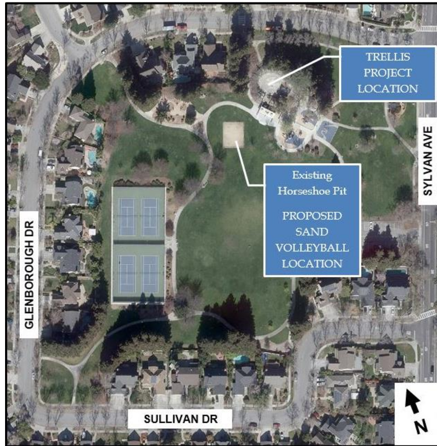
Figure 1: Location Map—Sylvan Park Improvements