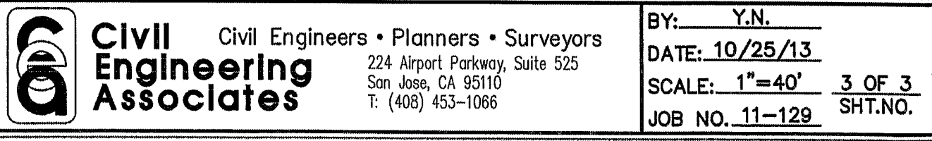
EXHIBIT B - Vacation of a portion of Stierlin Road