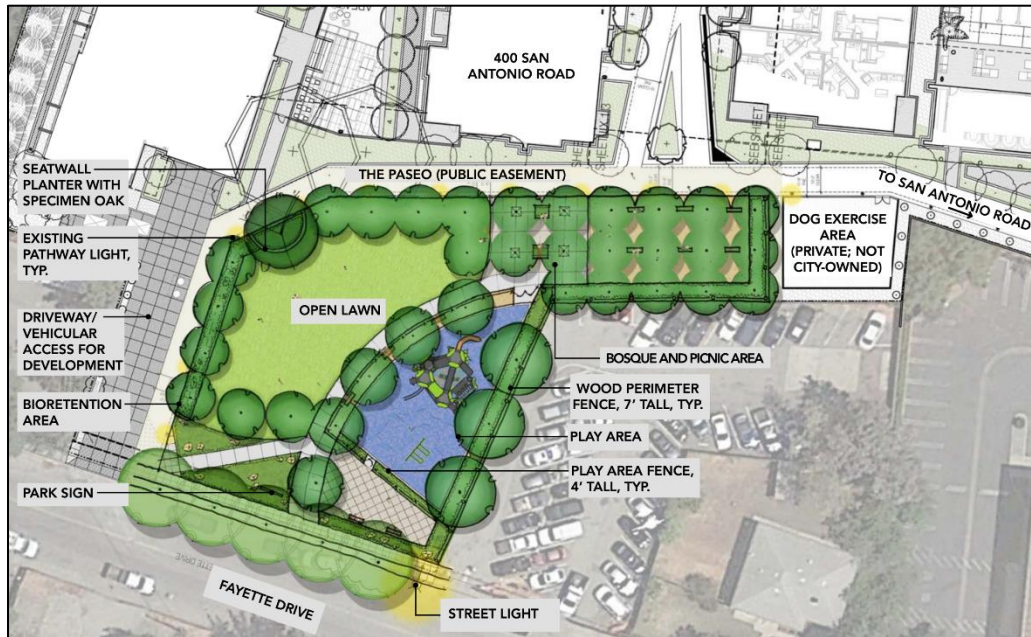
Figure 1: Fayette Park Approved Concept