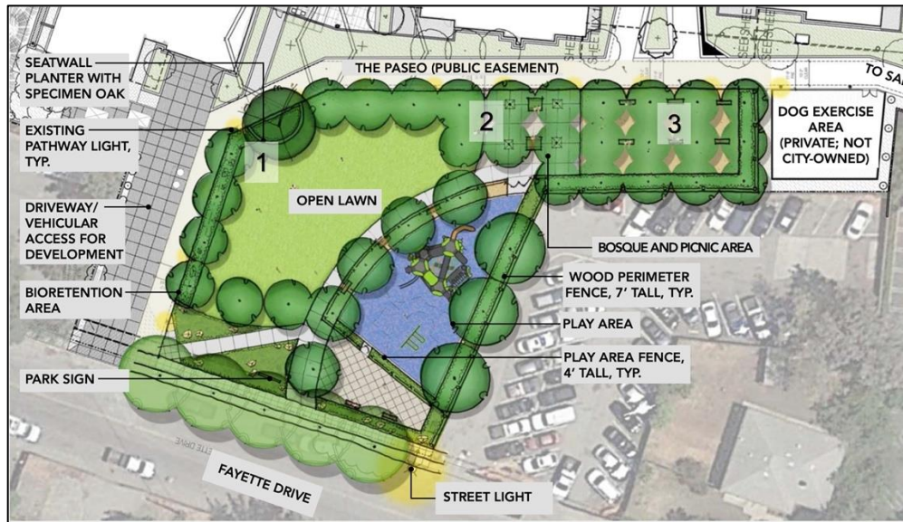
Figure 2: Location of the Three Sculptures