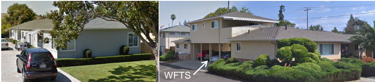
3-unit buildings. Left: 1-story, no WFTS. Right: WFTS, "House Over Garage" type.