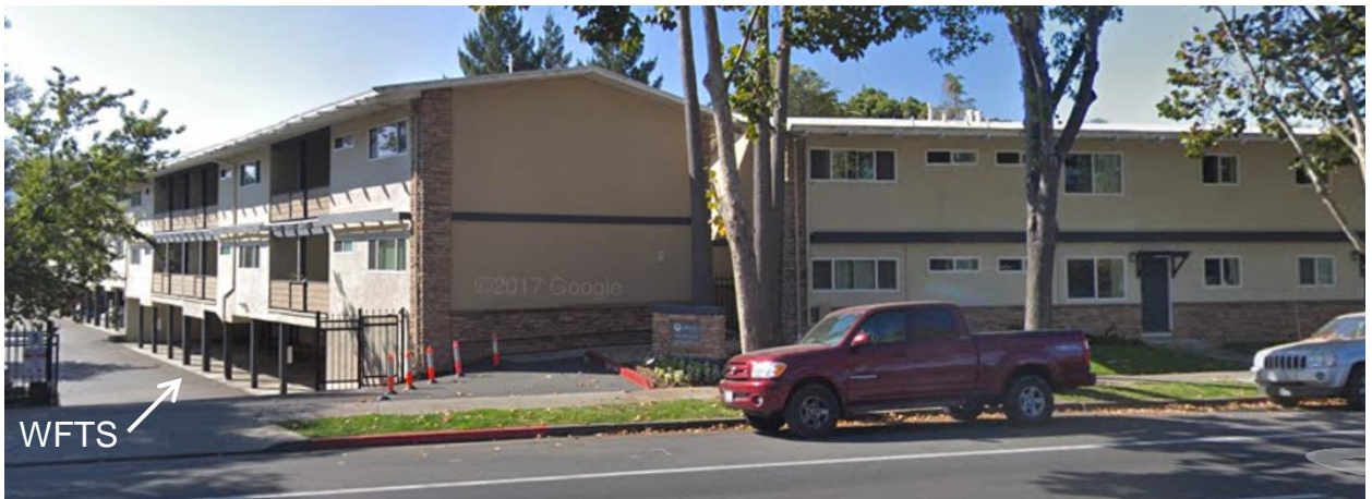
Different buildings on same parcel. Left: 3-story, WFTS, parking below grade. Right: 2-story, No WFTS