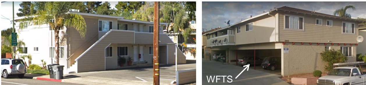
2-story, 6-unit buildings. Left: No WFTS. Right: WFTS, "Long Side Open" type.