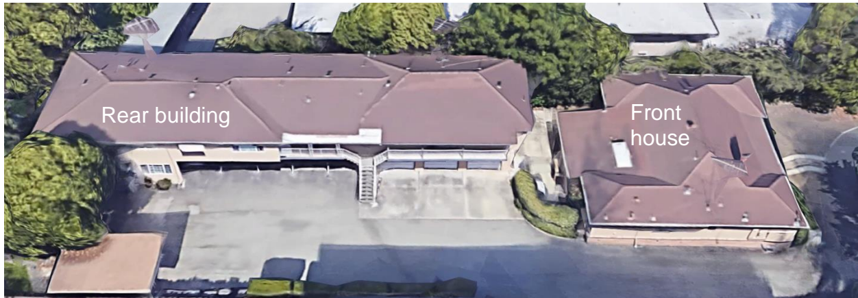
Front house (1 unit), with rear 5-unit 2-story building. Rear building presents WFTS condition.