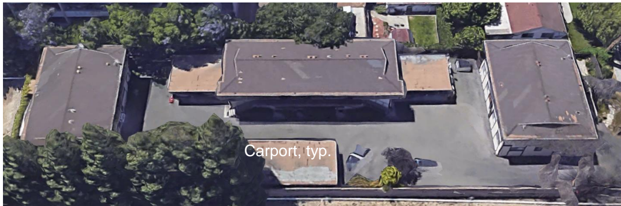
Three 2-story buildings (13 units total). No WFTS; parking provided under adjacent carports.