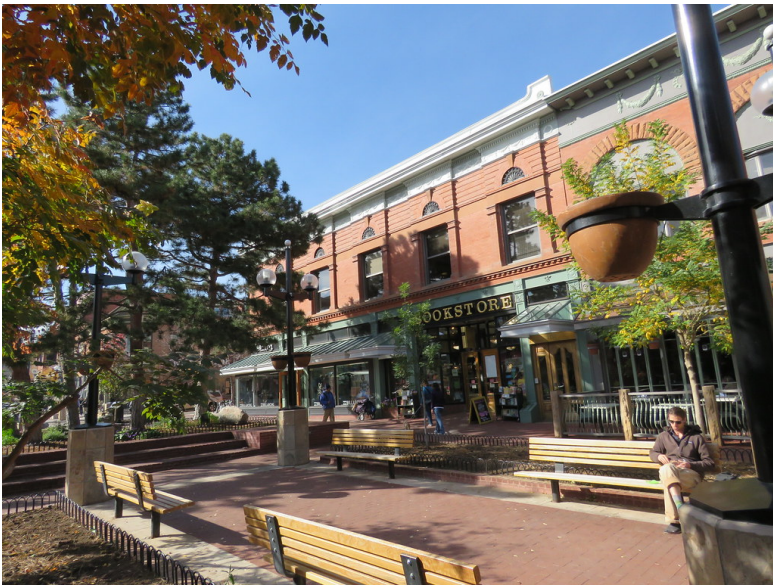
Pearl Street, Boulder, CO

Although the Precise Plan scope covers just the first three blocks south of Central Expressway, we do need to think more comprehensively, considering Castro all the way to at least El Camino, and north through the Transit Center and up Moffett Boulevard (which we should now think of as Downtown North going forward). Although, these two are their own projects with their own plans, all related plans and projects need to tie together. It would be wonderful if the train station plaza and crossing functions as the green knuckle that linked the north and side side together; a place as well as a hub for multi-modes of transportation. And effectively establishing a connected network of green spaces. We recognize the importance of linking Downtown to Moffett given that physical access across the tracks will be significantly hampered with grade changes, and that this is an opportunity to connect and enhance the urban park atmosphere we have. What a shame if we wind up with the transit center being just the terminus of everything rather than a beautiful and exciting urban park connection point to hold the city together at its centerpoint.