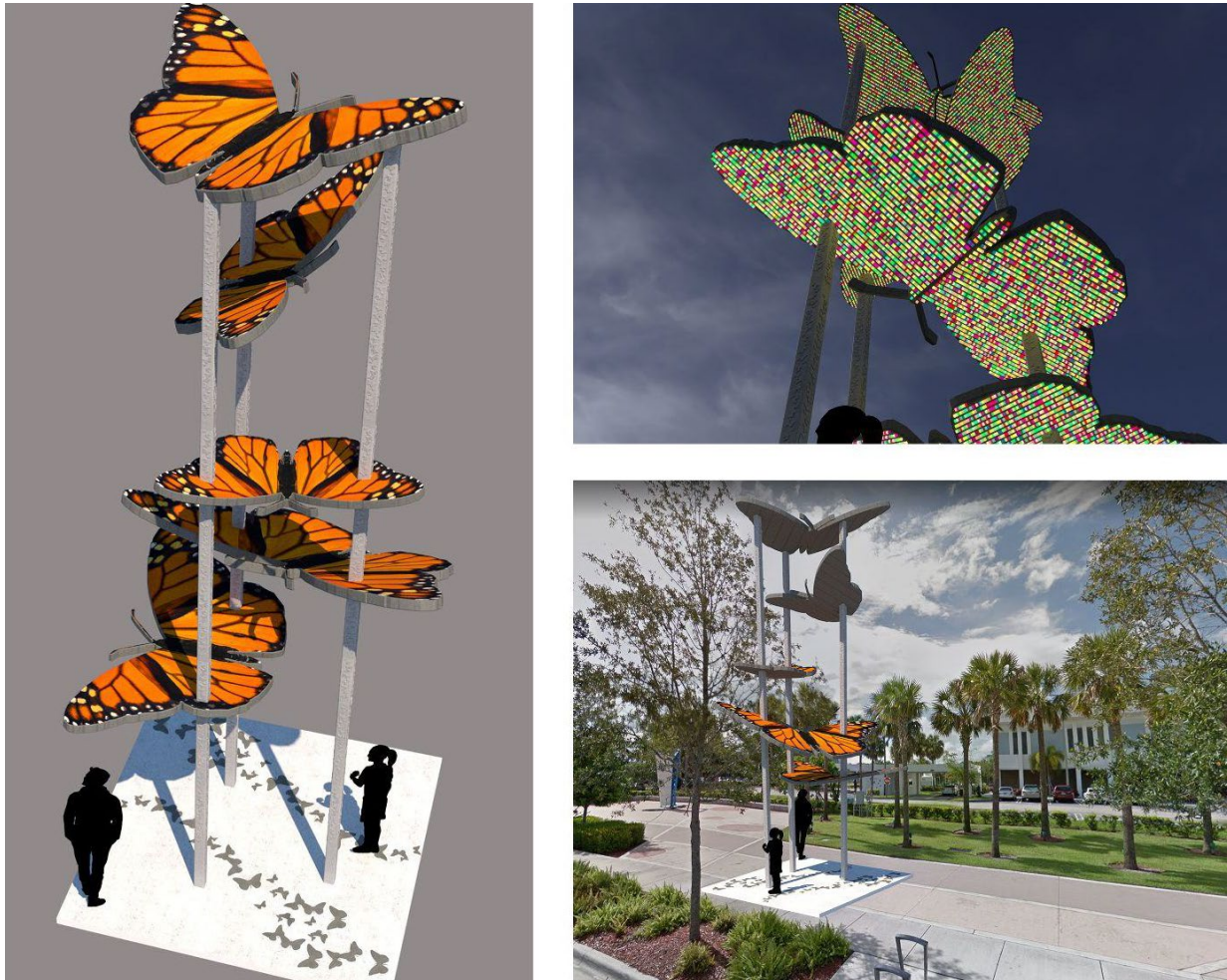
Figure 2: Looking Up Arts Original Concept—“Butterfly Reflect”

The original concept included an LED panel located on the underside of each butterfly that mimicked a visual of monarch butterflies migrating or flying.