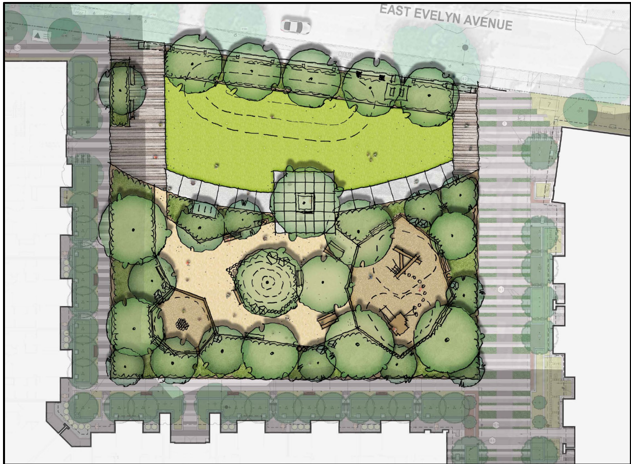
Figure 1: Evelyn Park

At the Visual Arts Committee (VAC) meeting on November 8, 2023, after issuing a Call for Artists (Attachment 2) for public art proposals and scoring and jurying the applications, the VAC selected Looking Up Arts' proposal for a monarch butterfly sculpture entitled "Butterfly Reflect" (Figure 2).