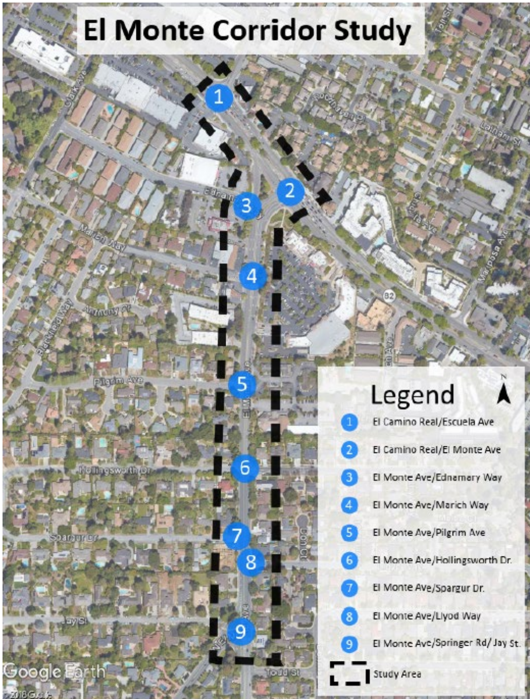
Figure 1: Project Area

Staff conducted several public meetings and outreach efforts for the project, including three community meetings (January 15, 2020, August 18, 2020, and July 21, 2022) and a public online survey released in December 2022. Staff presented the project to the Bicycle/Pedestrian