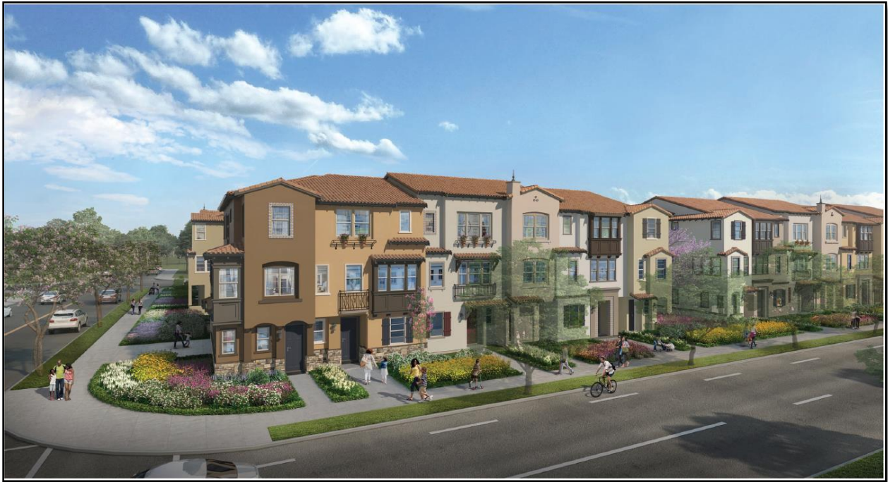
View from West Middlefield Road