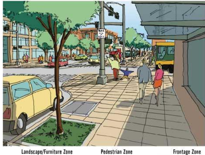
Exhibit B for 15.02.042: Corner Curb Radius Area