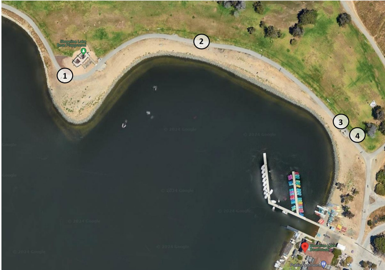
Figure 3: Overhead View of the Lakeside Path Bench Replacement Locations