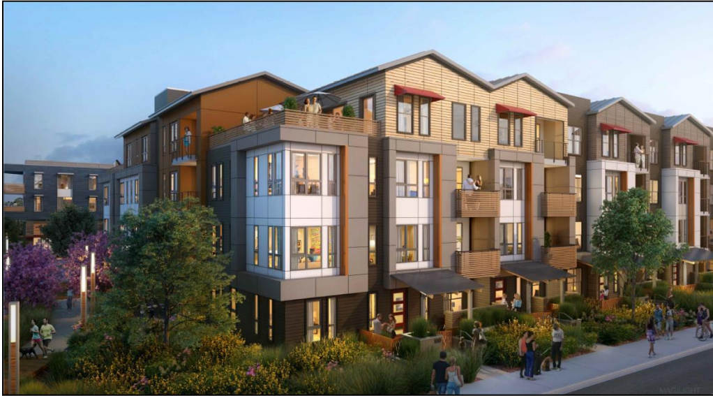
View from Middlefield Road Frontage "Building A"

The leasing office for the market-rate buildings is located in Building B in the southeast corner, close to the project's main entrance along Middlefield Road and adjacent to the east-west pedestrian/bicycle pathway.