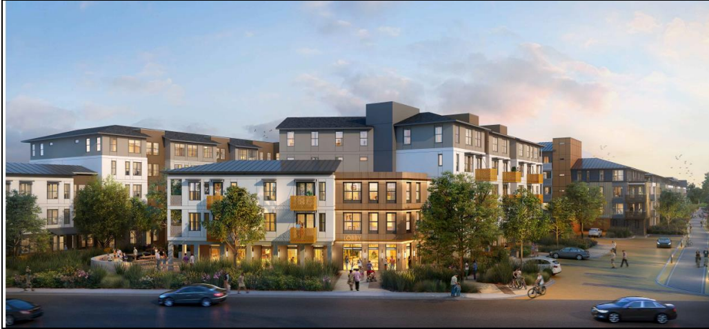
View from Middlefield Road “Building A”

designs, recess windows, and use building materials and detailing (including window trim) to incorporate more residential neighborhood character.