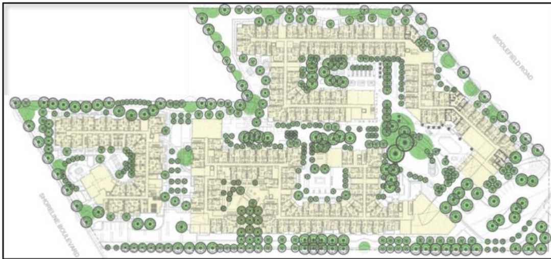
Proposed Planting Plan

The project site currently contains approximately 224 trees, 155 of which are Heritage trees (70 percent). Demolition of the existing buildings and construction of the proposed project would result in the removal of 127 Heritage trees and 43 non-Heritage trees on-site. A majority of the trees proposed for removal are due to poor health and/or conflict with the proposed buildings and excavation of the underground garage. Twenty eight (28) Heritage trees are proposed to be retained on-site, and 473 new trees are proposed to be planted as part of the development.