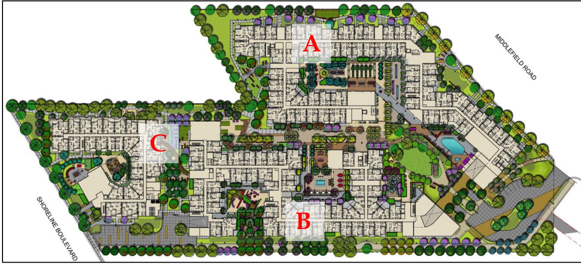
Project Site Plan

The project has two street frontages – Middlefield Road and Shoreline Boulevard. Each frontage has one vehicular entrance to the underground parking garage (see Attachment 12 – Project Plans). Various on-site amenities are included throughout the project site such as open-space areas, private residential balconies, swimming pool, hot tub, five courtyards, bike storage and repair facilities, two rooftop decks with amenities, private residential storage areas, barbecue pits, fitness rooms, and more. The project also includes a 14" Class I bike path connecting Middlefield Road and Shoreline Boulevard.