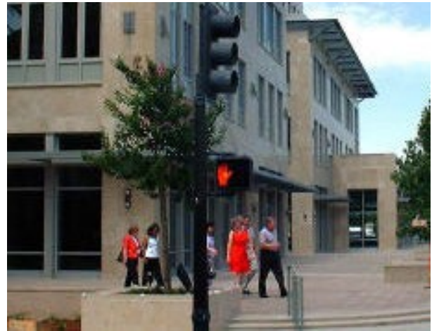
Fig. H.22: Both small and large-scale new development should preserve the rhythm and fine-grained pedestrian scale of existing buildings within the Historic Retail District by respecting the relatively narrow building increments, which are predominantly 25' to 50'.