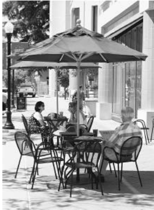
Sidewalk Cafes Outdoor dining on Castro Street.

Downtown Mountain View is largely perceived as the four blocks on either side of Castro Street between Evelyn Avenue and Mercy Street, comprising the historic retail district of the City. There is also a mix of uses in the areas on either side of the historic Castro Street commercial district. As shown on the following map (Figure 1), the boundaries of the Downtown Precise Plan include the historic Castro Street retail district, the central office core area and areas south of Mercy Street, including the new Civic Center and City Centre mixed-use project. Downtown Mountain View is surrounded by predominantly single-family neighborhoods. The changes in land use, building scale and activity mark the boundaries between these areas. Mountain View's Parking Assessment District is another boundary within the Downtown Precise Plan area. The Parking District allows for the assessment of fees for maintenance of public parking facilities. Additionally, the Revitalization District includes approximately 68 acres and is an area comprising 16 City blocks bounded by Evelyn Avenue on the north, View Street on the east, Mercy Street on the south and Franklin Street on the west. In general, the goal of the Revitalization District is to ensure downtown remains vibrant through economic development, building, streetscape and parking improvements, and community outreach.