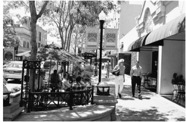
Fig. H.21: Outdoor patios and an engaging pedestrian experience Downtown.

In order to create well-defined street spaces consistent with the scale of downtown Mountain View, side yards are discouraged in favor of contiguous building facades along the street. However, narrow mid-block pedestrian passages that encourage through-block pedestrian circulation and/or arcaded spaces that create wider sidewalk areas for cafés, etc. are encouraged.